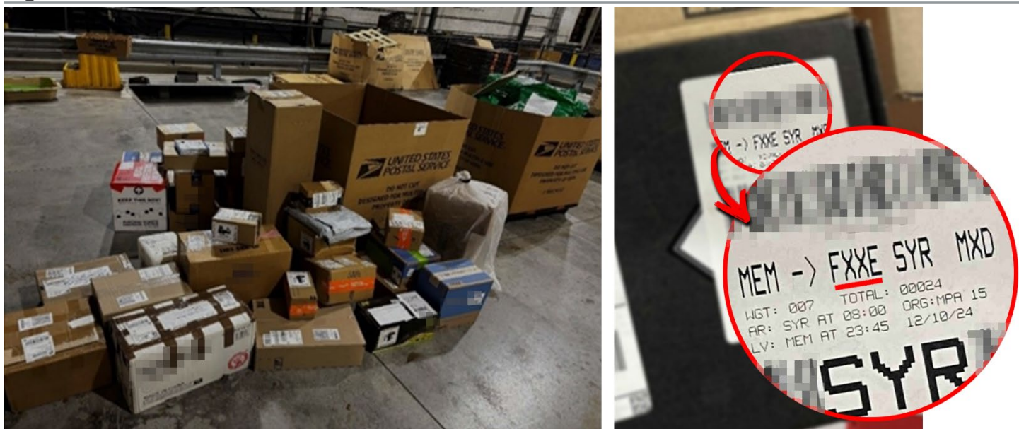
Figure 2. Missent HAZMAT at the New Carrier's Hub and HAZMAT With the Previous Carrier's Label

from their operations and send them to a local Postal Service processing facility for reprocessing and distribution. The new carrier sends daily reports to the Postal Service on HAZMAT packages found at its facility. In the first quarter of FY 2025, the new carrier reported a total of 2,411 HAZMAT-marked packages at the new carrier's hub. Of the 2,411 packages reported by the new carrier, we observed 70 packages with HAZMAT markings during our site visit. These 70 packages included HAZMAT with the previous carrier's labels and re-used packages with improperly removed HAZMAT markings (see Figures 2 and 3).