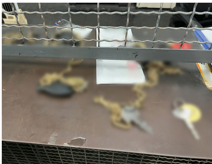
Figure 4. Unattended Arrow Keys [REDACTED]