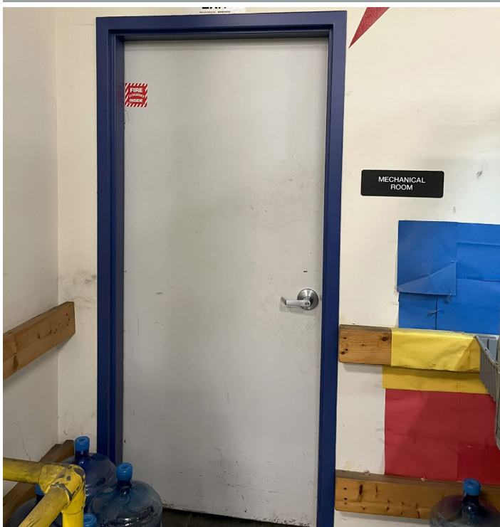
Figure 5. Inaccessible Fire Extinguisher