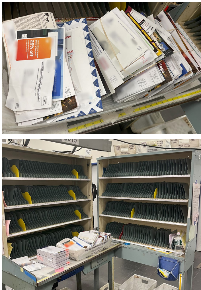
Figure 2. Examples of Delayed Mail in the Carrier Cases