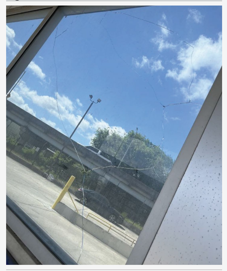
Figure 3. Cracked Window on Workroom Floor