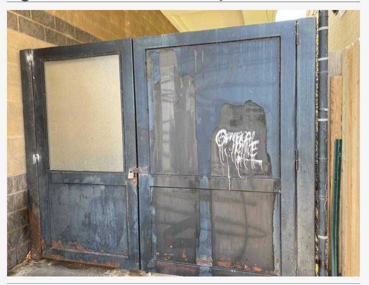
Figure 5. Graffiti on the Front, Retail Side

Source: OIG photo taken on June 15, 2023.