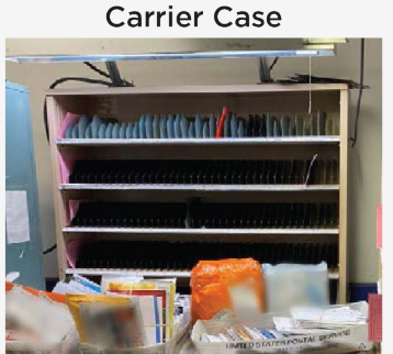
Figure 1. Examples of Delayed Mail in Carrier Cases and the Hot Case