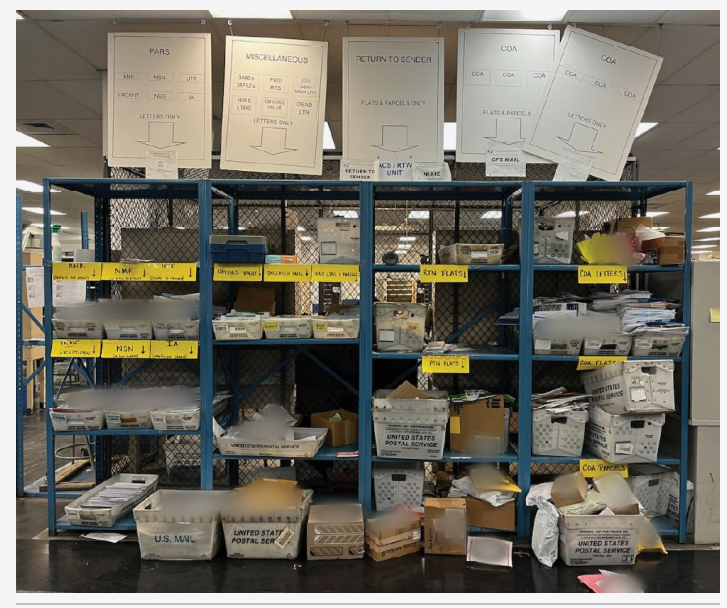
Figure 2. Examples of Delayed Mail on Workroom Floor