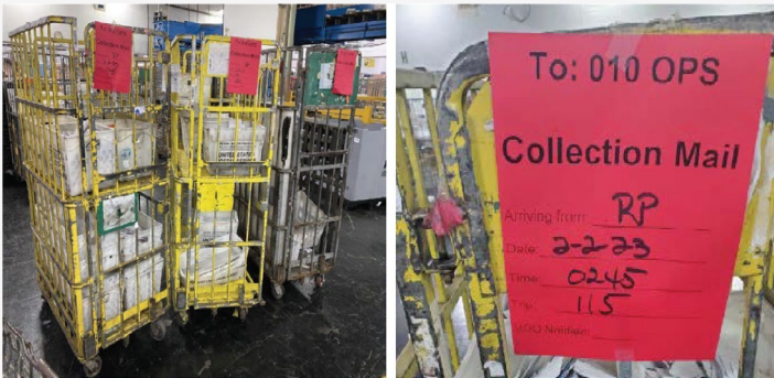
Figure 4. Late Arriving Collection Mail from Royal Palm P&DC