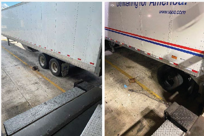
Figure 6. Trailers Without Wheel Chocks