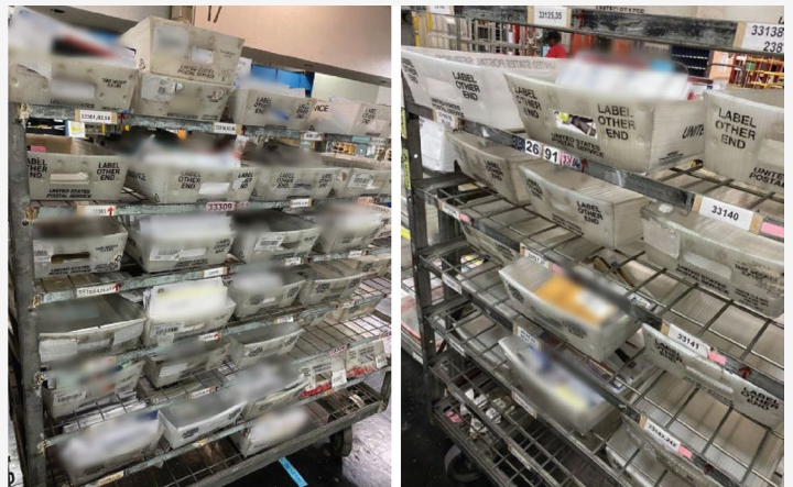
OIG photos taken February 1, 2023 at 6:30 a.m.