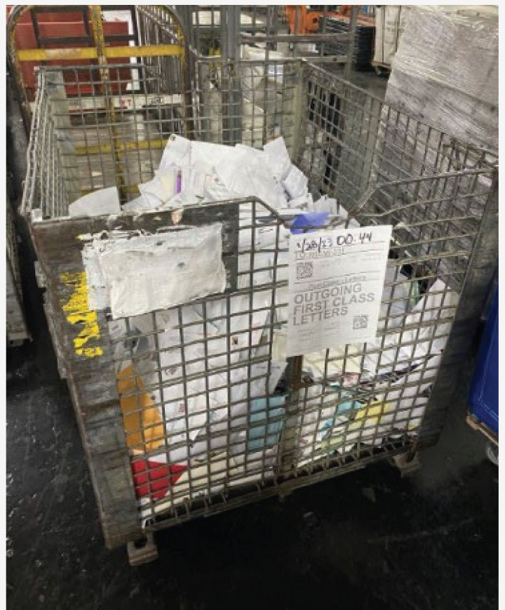
OIG photos taken January 30, 2023 at 3:15pm.