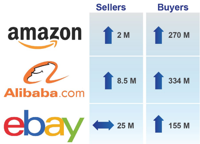
Figure 2: Major E-Commerce Marketplaces

Larger hosted software solutions like Shopify and Bigcommerce have a diverse range of applications for merchants when setting up their own digital store. Their services do not require customers to use every available app; rather, the tools are available as à la carte add-ons as businesses grow and need to automate more aspects of their operations. 35 Depending on