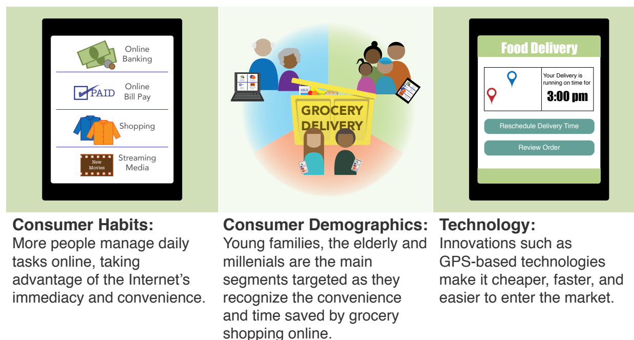
Figure 2: Reasons for the Rise of Grocery Delivery

As consumers' expectations continue to change and new technologies emerge, the Postal Service should not overlook the potential in the grocery delivery market. Newcomers as well as established grocers are quickly realizing this.