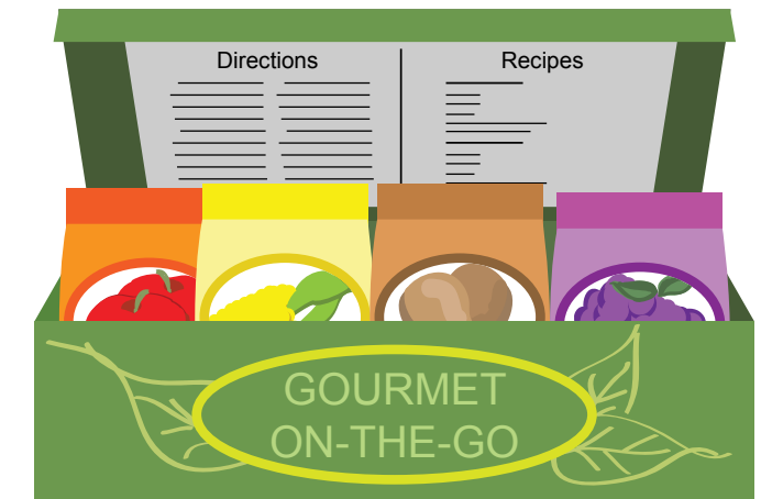
Figure 4: Recurring food deliveries offer a wide range of possibilities in partnerships.

Subscription food services. Home-delivered food subscription services offer another opportunity for new partnerships. Similar to online grocery shopping, these services are appealing to consumers who are increasingly shopping online and desire convenience. Besides avoiding frequent trips to the grocery store, customers also get back the time that planning and preparing take. Because of demand, the number of providers in this space is growing. These services are gaining the attention of venture capital funds, new companies are entering the market, and more software developers are creating subscription commerce platforms to run at low cost. 41 Blue Apron, a growing startup in this market that received an additional $50 million in funding from GrubHub in 2014, went from delivering 100,000 meal kits in 2013 to 600,000 earlier in 2014. 42 Another food subscription service — Nature Box — shipped 50,000 boxes in 2011 and increased that number to 1 million by 2014. 43 New entrants are also trying to carve out their own piece of the diet food market — a market valued at over $800 million in 2012. 44 Traditional diet food delivery services such as NutriSystem and Jenny Craig will be competing with meal delivery startups such as Hello Fresh, Freshology, and Z.E.N. Foods as this space continues to attract investments.