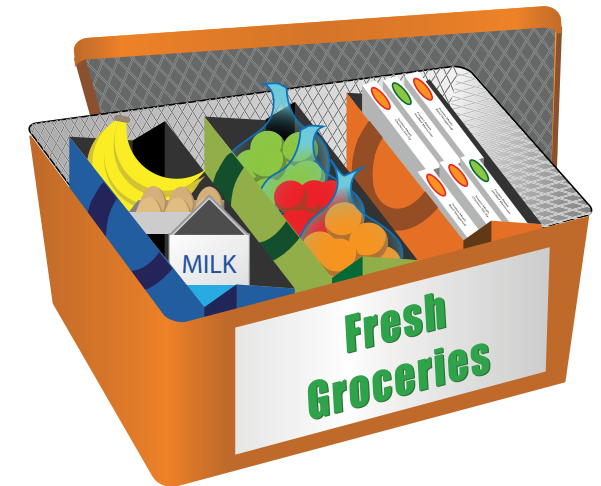
Figure 3: Many Grocery Delivery Services Use Insulated Boxes, Eliminating the Need for Refrigerated Vehicles