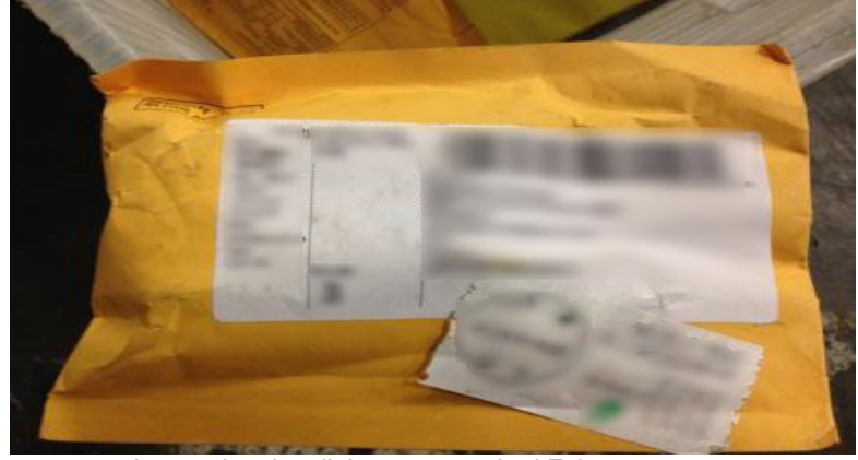
Figure 2. Mailpiece About 9 Months Old

International mailpiece postmarked February 2014.