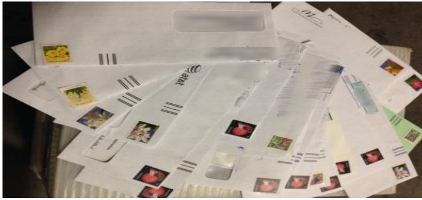
Figure 6. First-Class Mail That Was Not Cancelled

Nineteen pieces of First-Class Mail that was not cancelled.