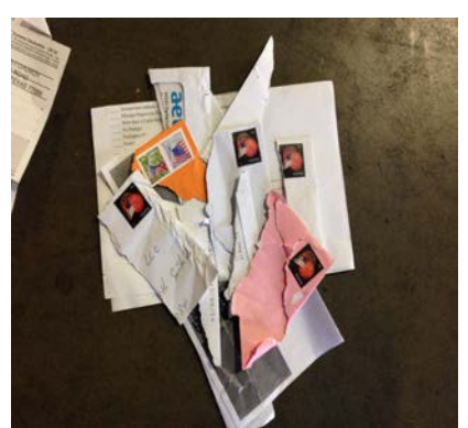
Figure 3. Open, Loose, and Damaged Mail

Some of this mail was also open, loose, or damaged. Examples found included damaged personal greeting cards, a passport and loose prescription medication<sup>9</sup> (see Figure 3).