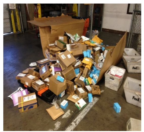
Figure 1. Trays and Gaylords Containing Mail