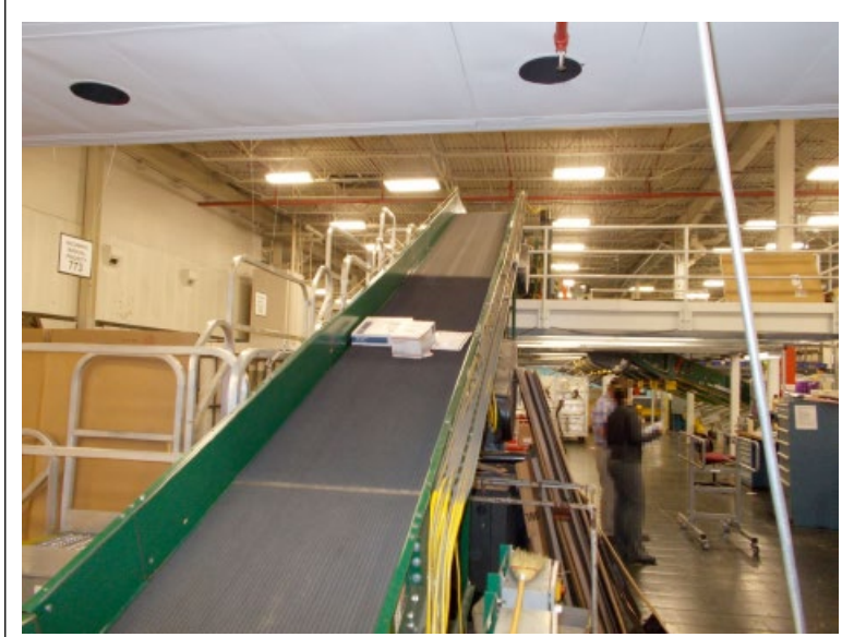
Figure 2. APBS Feed System (conveyor belt)