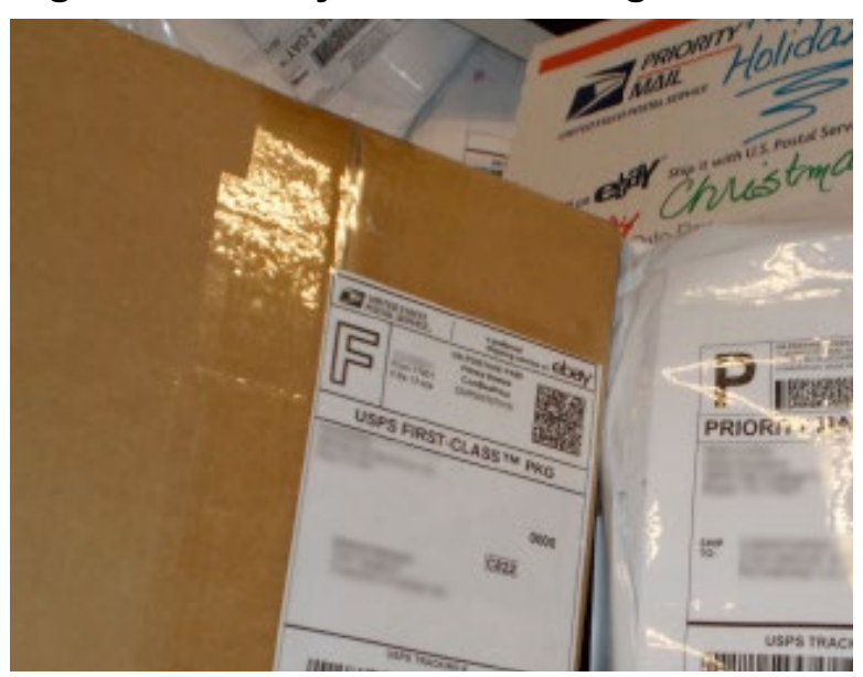
Figure 1. Priority Mail® Commingled With FCM