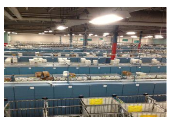
Figure 2. DBCS Machines at the Huntsville P&DF

The Postal Service completed consolidation of the Huntsville P&DF originating mail operation on December 31, 2011. Destinating mail parcels moved to the Birmingham P&DC in April and May 2012 and destinating flats and part of the letter processing operation moved in May and June 2013. The DPS processing of letter mail remains in Huntsville and continues to be sorted on 10 DBCS machines (see Figure 2). Management indicated this operation will remain at the Huntsville P&DF to maintain the existing overnight service standard for delivery of FCM.