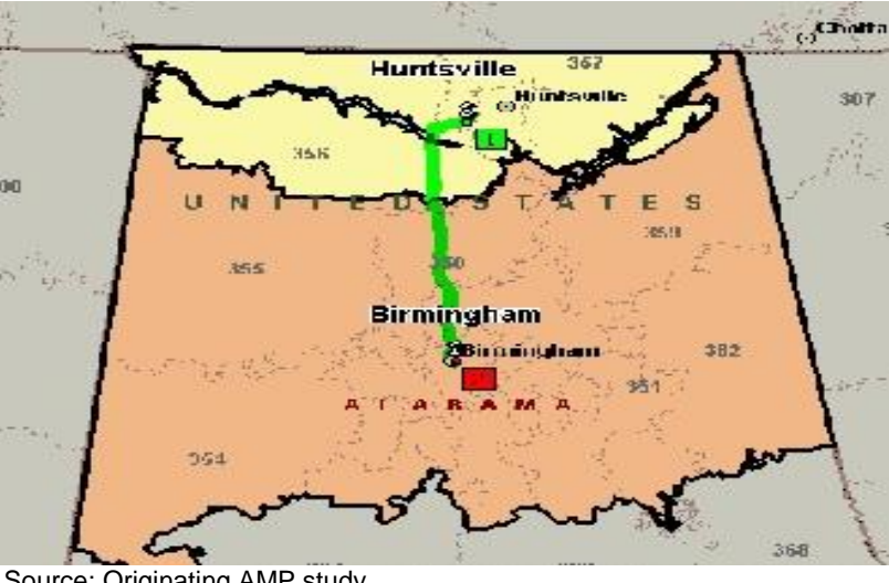
Figure 1. Map of Alabama