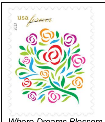
Where Dreams Blossom stamps were not available at more than 24 percent of PRUs.

We also identified six separate occasions where SDC stock was depleted and resulted in backorders and delayed fulfillment from March to June 2013. In addition, we noted shortages with popular commemorative stamps and special issue stamps, including Where Dreams Blossom stamps,