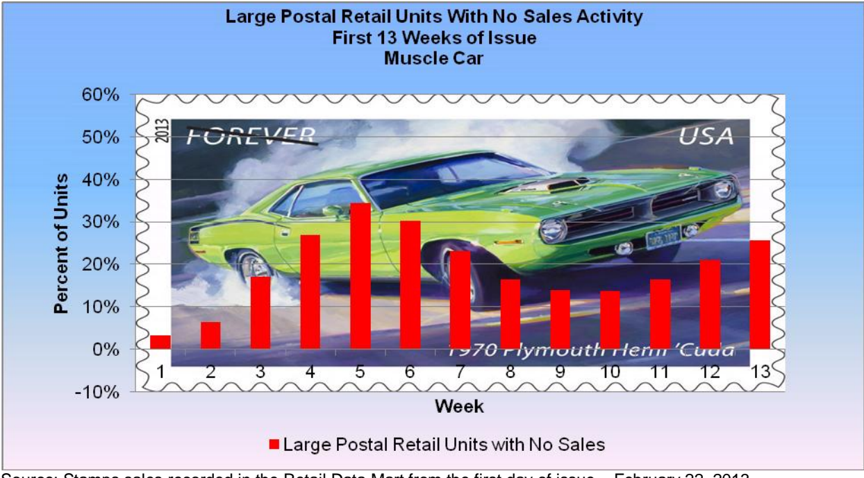
Figure 1. Muscle Car Sales at Large PRUs

For example, 34 percent of the large PRUs did not have sales of the "Muscle Car" commemorative stamp during the 5<sup>th</sup> week after the first day of issue (see Figure 1). PRUs did not have adequate supplies because sufficient stock amounts were not initially distributed to the SDCs and too much lead time was needed to order additional supplies in a timely manner for PRUs.