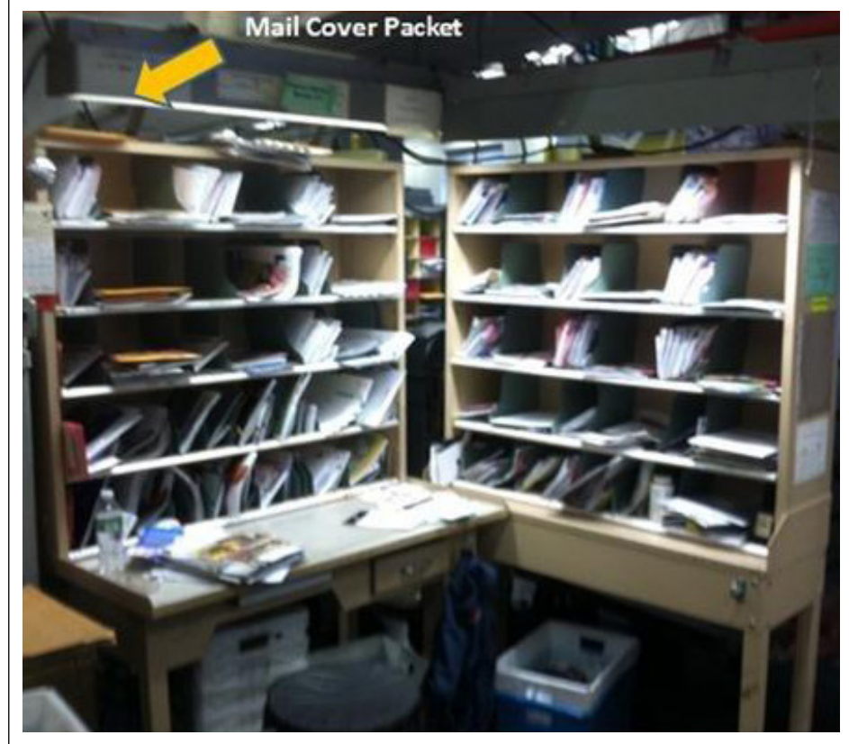
Figure 1. Mail Cover on Mail Casing Station