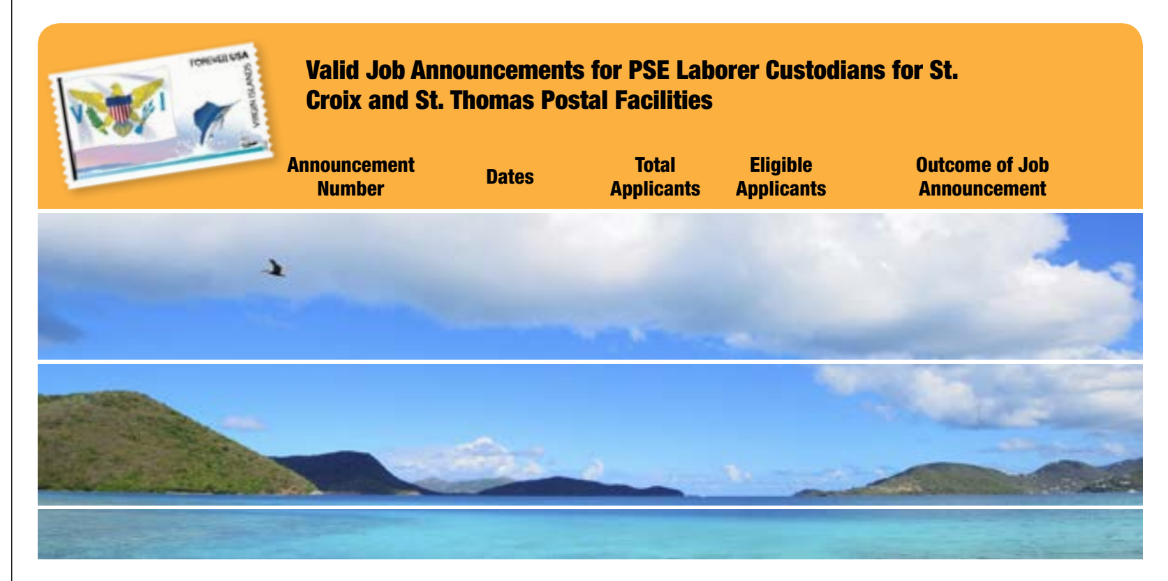
Table 2. Valid Job Announcements for PSE Laborer Custodians for St. Croix and St. Thomas Postal Facilities