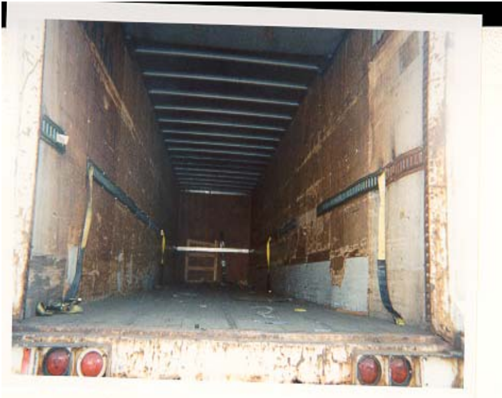
Picture 4: Trailer with damaged and missing load restraint system panels on the sides of trailer, which are used to secure mail or other cargo.