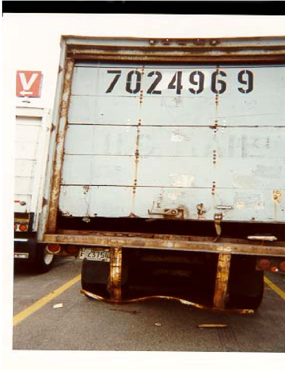
Picture 1: Trailer with excessive rust and damaged cross bar that protects vehicles from sliding under the trailer.