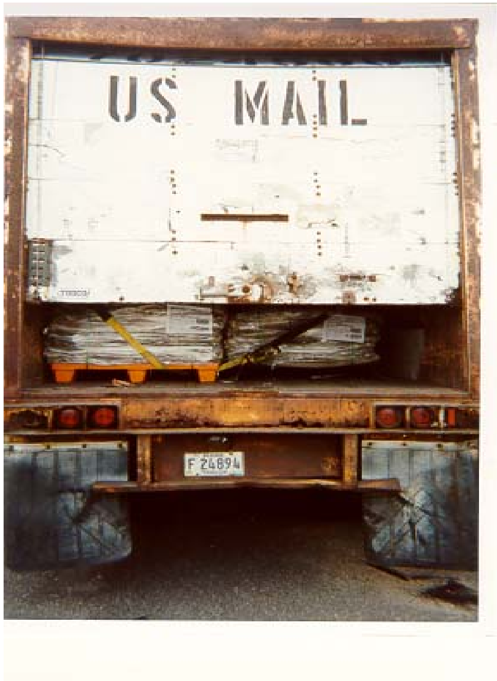
Picture 2: Trailer with excessive rust that reflects poorly on the Postal Service.