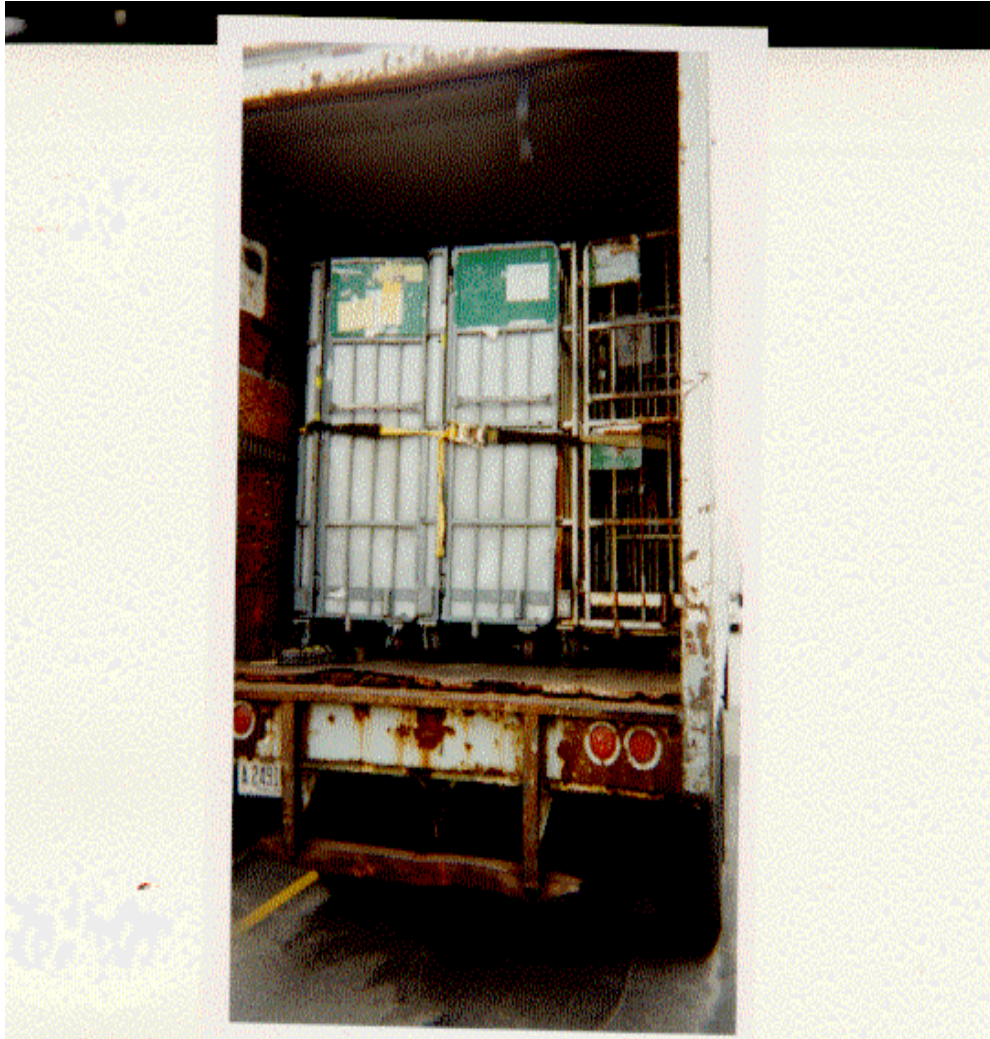
Picture 6: Trailer used to store empty mail transport equipment. Also note rotting floorboards and excessive rust.