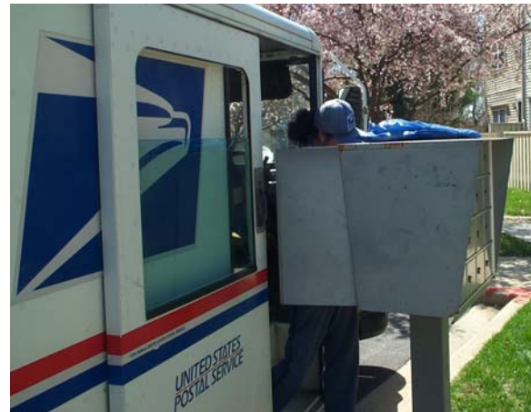
Letter carriers delivering mail to cluster boxes in Baltimore, Maryland.