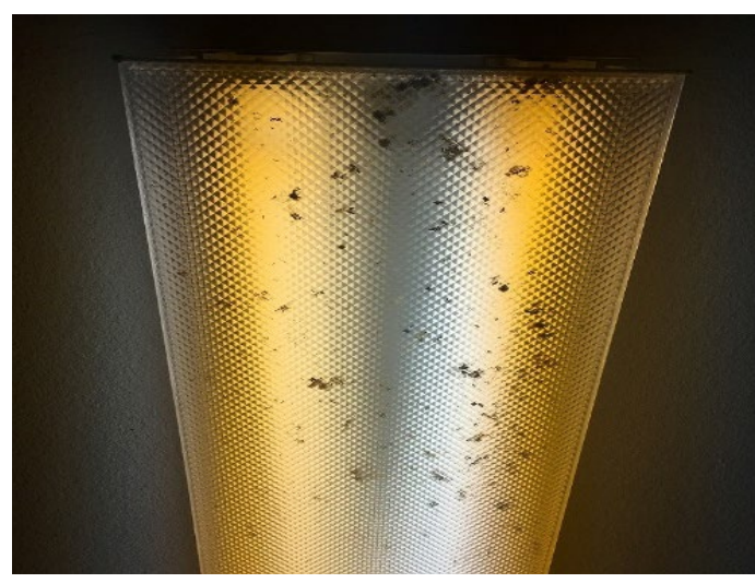
Tonto Basin Post Office, Tonto Basin, AZ.