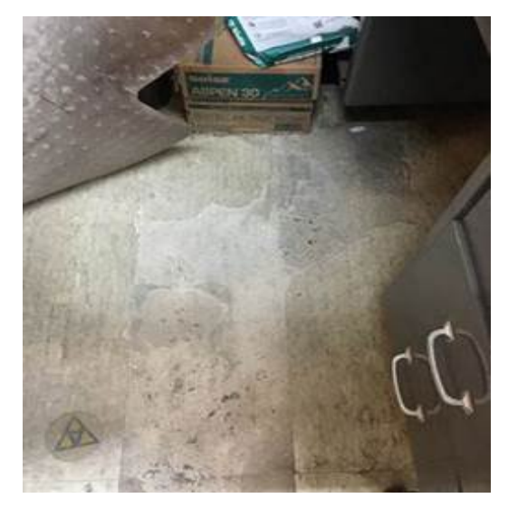
Figure 3. Cracked and Broken Asbestos Floor Tiles