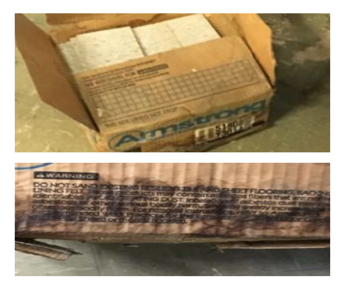
Source: OIG photo taken December 7, 2017, Westminster Post Office, Westminster, CA.