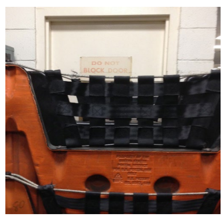
Figure 5. Blocked Exit