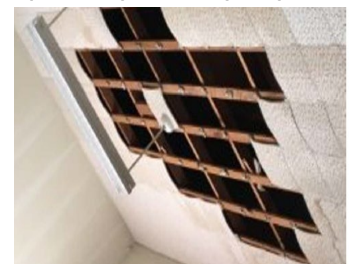
Source: OIG photo taken December 7, 2017, Westminster Post Office, Westminster, CA.