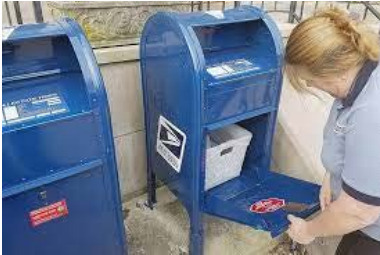
FIGURE 2: DAILY BLUE BOX COLLECTION