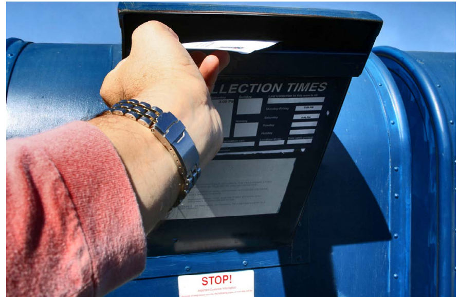
FIGURE 4: BLUE BOX LABEL

The same communication challenge can occur when a box is taken out of service due to damage, such as vandalism or being hit by a car. The replacement box will require a new set of labels (Figure 4). Replacement labels can only be printed by District officials. First, the local maintenance group must submit a request for the replacement label via email or telephone. After reviewing the request, the District official prints the label and mails it to the maintenance facility. While the process of printing the label takes place within CPMS, the process of requesting the label occurs outside. This can create inefficiency in the communication channels, similar to the current process used by postmasters to alert the District about collection box suspensions described above. The District official serves as an