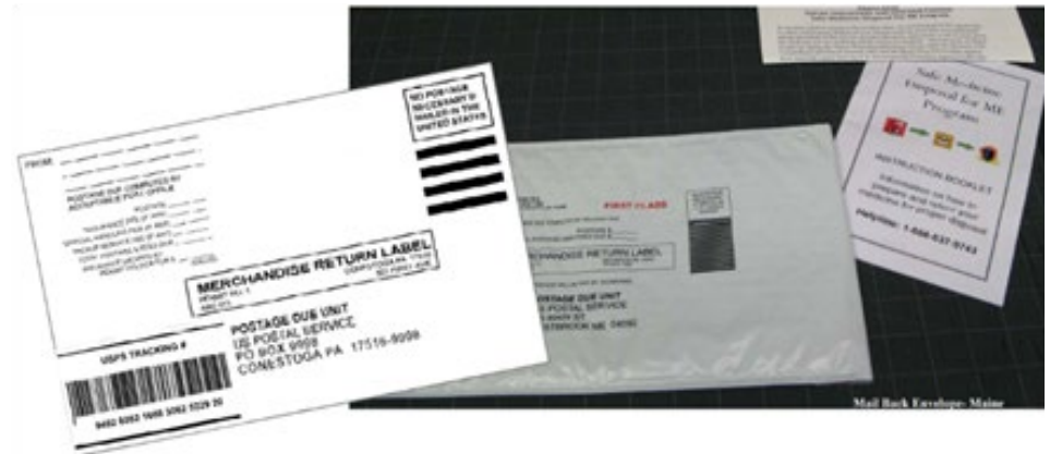
Figure 2: DEA-Approved Envelope

To assist Americans in the proper disposal of unwanted, unused, or expired prescription medications, the Drug Mail-back Program — a partnership between federal agencies and the private sector — was established. 6 The program's goal is to decrease the amount of prescription medications, including controlled substances such as opioids, that are misused, abused, or accidentally ingested. 7