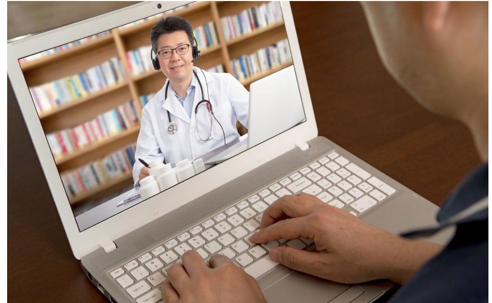
Figure 6: Telehealth Session

with health professionals became considerably more widespread. Prior to the pandemic, less than one percent of patient medical experiences were conducted via telehealth. In April 2020, that number rose to 13.9 percent. 51