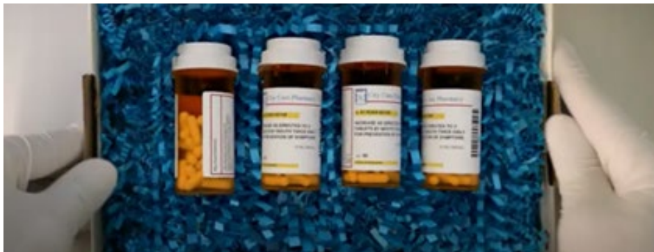
Figure 1: USPS Prescription Delivery

In normal times, millions of people, especially those with chronic health conditions, depend on the Postal Service for the timely, reliable, and low-cost delivery of their daily medications. This can be particularly important in rural areas where the closest pharmacy may be miles away. During the COVID-19 pandemic, reliance on mail-order prescriptions has increased — 20 percent by some industry estimates — as more people stay home and turn to the mail for essential items. 5 A representative from a major pharmacy chain told the OIG that its medication shipments increased 33 percent during the pandemic, due to shifting patient and consumer behaviors.