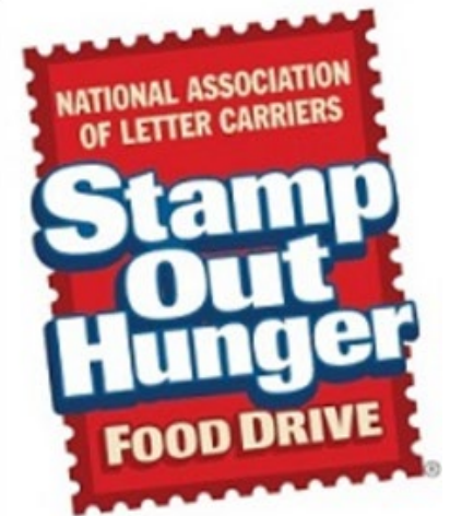
Figure 3: Stamp Out Hunger® Food Drive logo

In 2019, about 11 percent of households in the United States were food insecure, including veterans, children, and the elderly. 11 The pandemic has only worsened the problem. 12 To help fight hunger in the communities they serve, letter carriers represented by NALC and other postal unions, with support from the Postal Service and national partners, conduct the Letter Carriers' Stamp Out Hunger® Food Drive — the nation's largest one-day food drive. 13 Each year on the second Saturday in May, millions of Americans put bags of non-perishable food items on their porch or near their mailbox for postal workers to collect as they deliver mail along their routes. These donations then go directly to local non-profit charity food agencies for distribution to