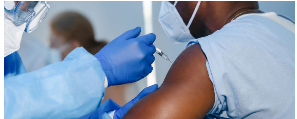
Figure 4: Vaccine Being Administered

dependent on a cold chain, it would have to overcome the challenges of service variability and ensure precise tracking of vaccines.