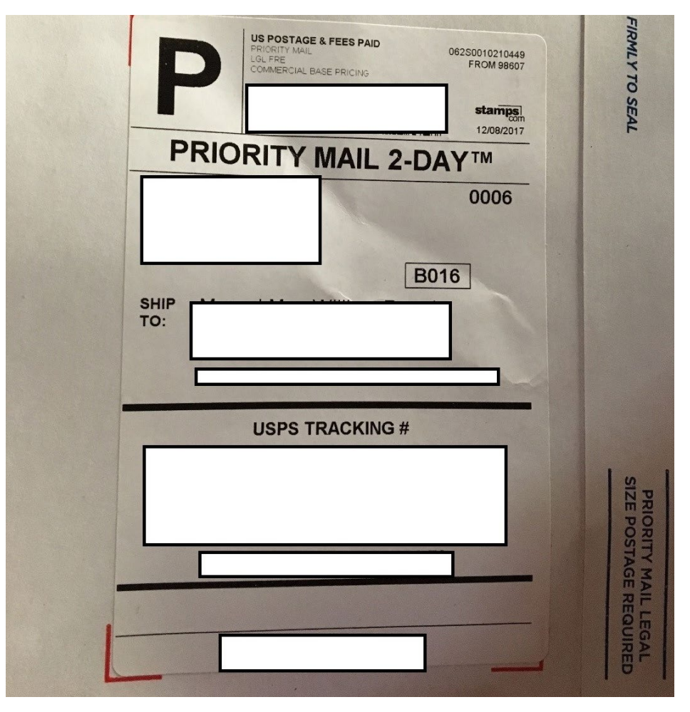
Figure 1. Priority Mail Piece Found Mixed with UBBM

Source: OIG photograph taken March 6, 2018, of a Priority Mail piece dated December 8, 2017, found mixed with UBBM at the Detroit NDC.