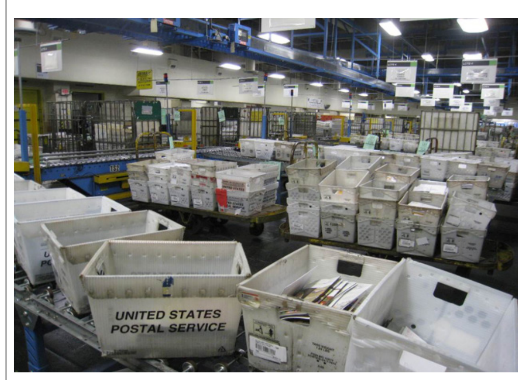
Figure 1. Low Cost Tray Sorter Not Properly Staffed