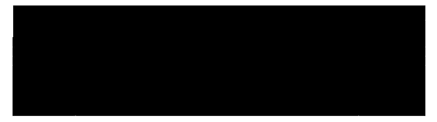
Table 2: Service Scores for the Akron and Canton Performance Areas

improvement since the consolidation, each moving up at least one percentage point or more. See Table 2 below for additional information.