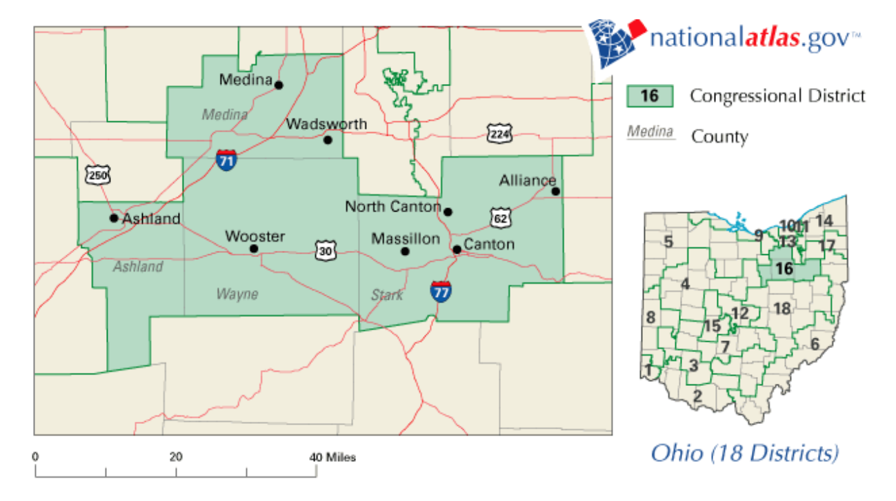
Map 1: Ohio's 16<sup>th</sup> Congressional District

In Septembers 2005, the U.S. Postal Service Office of Inspector General (OIG) assessed the efficiency of operations performed at the Canton P&DF and examined the proposed consolidation of outgoing mail processing operations in the Akron P&DC. We concluded a favorable business case existed for moving outgoing mail processing operations from the Canton P&DF to the Akron P&DC. Specifically, we concluded consolidation would reduce labor and distribution costs, increase processing efficiency, potentially improve delivery service, and reduce workroom floor congestion.