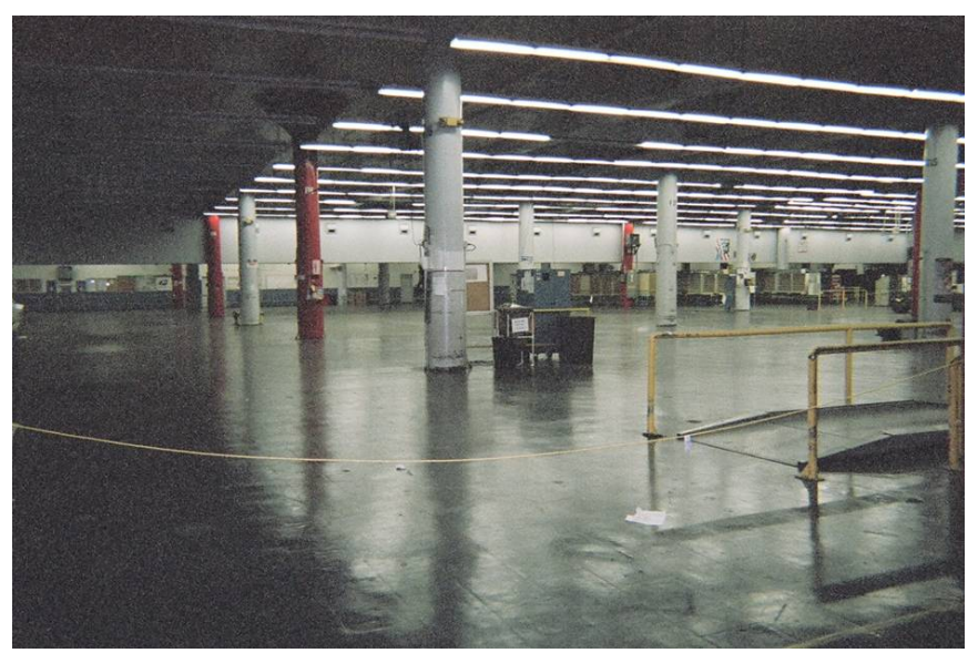
Illustration 1: Excess space on second floor at Worldway AMC.

We found excess space for mail processing existed at the Worldway AMC. In January 2005, all automation equipment for mail processing operations was removed from the site when the Worldway AMC transitioned to an ATC. This change left the second floor empty except for the areas used to secure and process registered mail and to store excess equipment. (See illustration below.)