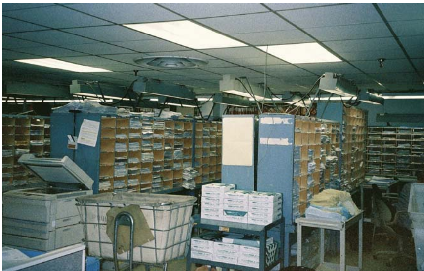
Illustration 1. Airmail Records Unit at the New York ISC. The work at this unit could be automated to reduce workhours.

To improve operating efficiency at the Airmail Records Unit, we recommend the Manager, New York International Service Center: