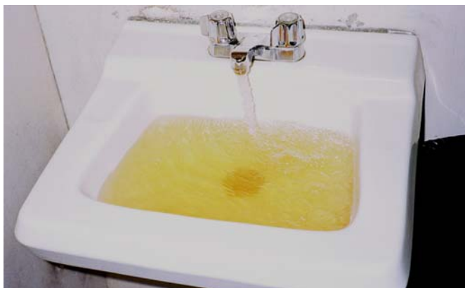
Tainted water running from the first floor employee bathroom sink.

report emphasized that the second floor walls and ceiling were significantly damaged, asbestos-containing debris was scattered on the floor, and the asbestos presented imminent exposure risk to building occupants. The report recommended the district: