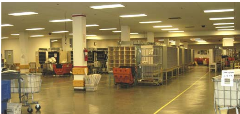
Baltimore Carrier Annex located less than 2 miles from Patterson Station.

Carrier Annex. During the fall 2003, we visited Patterson Station and verified that Postal Service had relocated carrier operations. Management stated they were removing equipment, and that the facilities lease office was negotiating lease cancellation.