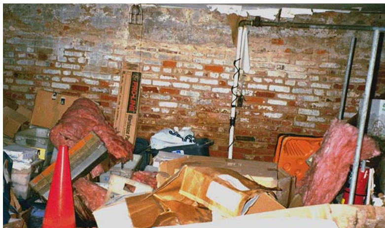
Basement area with trash, junk, and flooded conditions.

The purpose of this advisory is to confirm our verbal notification to Postal Service officials concerning Patterson Station conditions, to document our recommendations, and to report management's response. During our work, we reviewed the Patterson Station lease, the Asbestos Survey Report, and the Decision Analysis Report. We also reviewed other relevant documents including building maintenance work orders for the period August 2001 through July 2003 to identify any work performed to repair or mitigate substandard conditions. We physically inspected and photographed Patterson Station, interviewed managers and employees, and identified the proximity of alternate facilities. Work associated with this advisory was conducted from June through February 2004 in accordance with the President's Council on Integrity and Efficiency, Quality Standards for Inspections . During our work, we routinely notified Postal Service officials of substandard conditions we observed, generally discussed our observations and recommendations with them, and reported their comments and specific action, where appropriate.