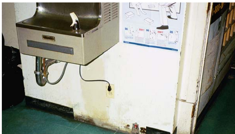
First floor drinking fountain which is leaking water over exposed electrical outlet.

and that the Baltimore District could save $25,000 by terminating the Patterson Station lease currently due to expire in November 2004. Patterson Station delivery personnel were exposed to unsafe conditions because: