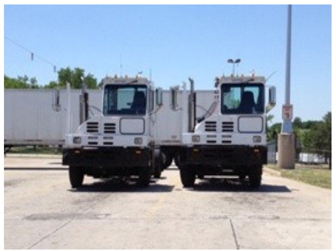
Figure 1. Spotter Trucks at St. Louis NDC

U.S. Postal Service network transportation using Postal Service vehicles and employees is referred to as PVS. Because PVS operations are local, they are managed at the facility level under guidance from district, area, and headquarters transportation officials. PVS activities at NDCs include yard operations, which is the movement of trailers and equipment in or around a facility yard (spotting), typically to and from the facility dock doors. This movement of trailers is performed by PVS drivers using spotter trucks<sup>1</sup> (see Figure 1).