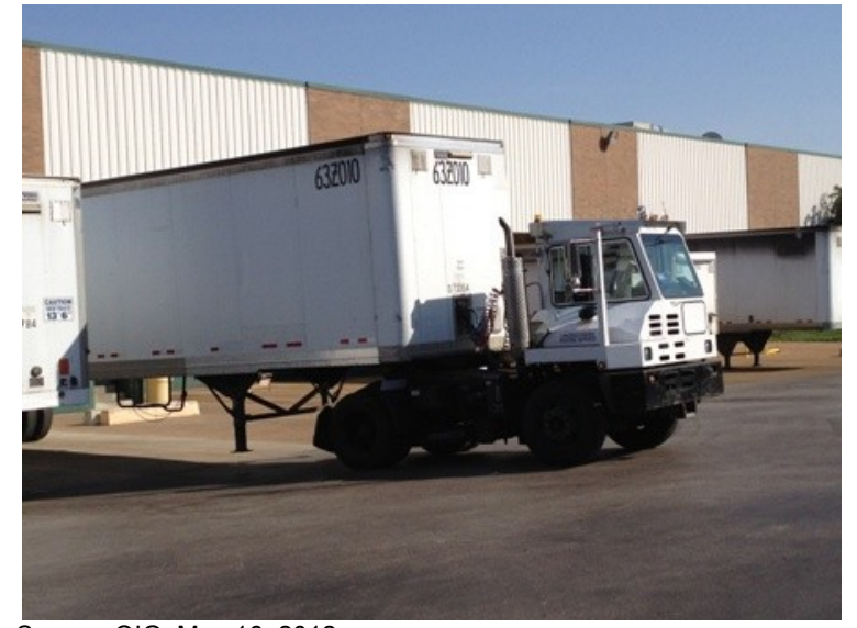
Figure 2. Spotter Truck Moving Trailer in the St. Louis NDC Yard

The St. Louis NDC has a staff of 15 PVS drivers responsible for an average of 1,657 moves per week servicing 113 dock doors at the NDC and 24 dock doors at the annex.