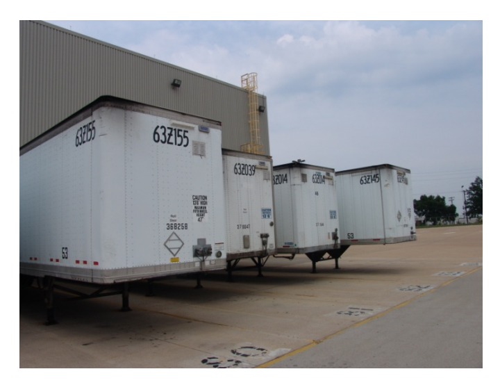
The Postal Service uses a unique numbering system for TIP "National Trailer Lease" trailers it assigns to facilities. We photographed these trailers, beginning with the numbering sequence "63Z", at the St. Louis Bulk Mail Center (BMC) on August 20, 2008.

<u>Initial National Trailer Lease</u> – In September 2000, the Postal Service signed a National Trailer Lease contract for 4,475 trailers with TIP, Inc., a wholly owned trailer and equipment-leasing subsidiary of General Electric Company.