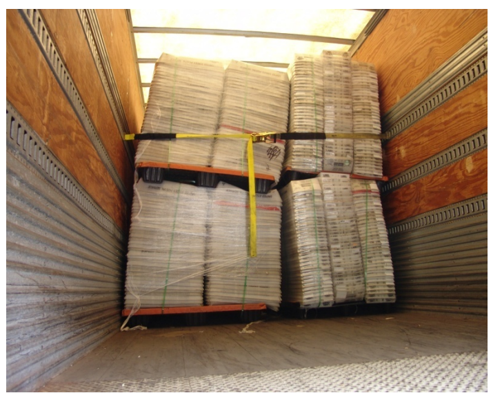
Stored equipment at the St. Louis Pine Street Lot, August 20, 2008.

The Great Lakes Area had excess trailers because it did not have a comprehensive process for identifying trailer requirements and ensuring their proper use. Local managers identified control weaknesses and stated that Great Lakes Area BMCs and other local facilities used trailers to store excess equipment due to the lack of storage space.