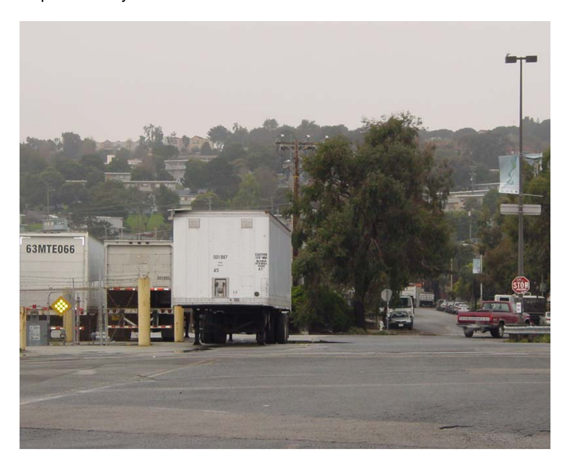
An MTE trailer and other trailers stored at the unsecured lot near the San Francisco P&DC on January 9, 2008.

In October 2001, the Postal Service signed a lease with the San Francisco Port Commission for an unsecured parking lot near the San Francisco P&DC. P&DC officials explained they needed the lot to store trailers.