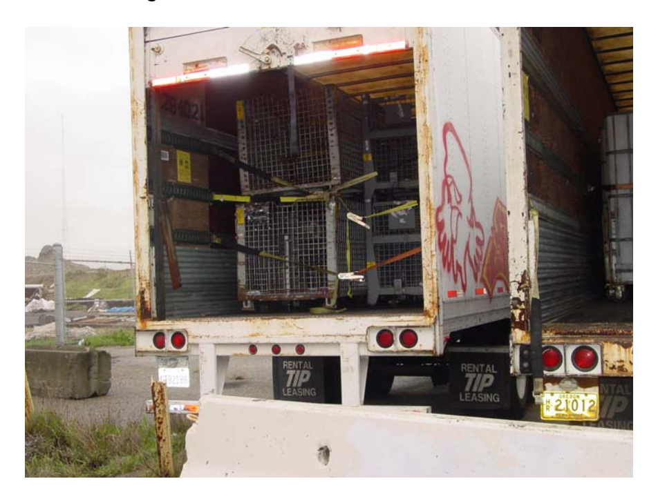
This unlocked trailer was used to store Postal Service equipment. Security is an ongoing concern. This is the same graffiti covered TIP trailer shown on page 6. We took that photograph October 17, 2007, and this one on January 9, 2008.

On January 9, 2008, we inspected the leased parking lot near the San Francisco P&DC, and observed 54 Postal Service owned or leased trailers that San Francisco P&DC managers had stored there. The lot was unsecured, many trailers were vandalized with graffiti or otherwise damaged, most trailers were unlocked, and San Francisco P&DC