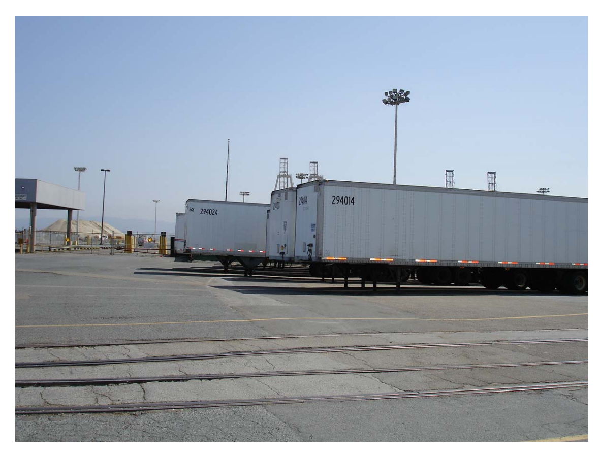
Here is another view of the unsecured lot located adjacent to industrial activities and parklands along the San Francisco Bay. Photograph taken May 17, 2007.

We conducted work associated with this performance audit report from May 2007 through March 2008 in accordance with generally accepted government auditing standards. Those standards require that we plan and perform audit work to obtain