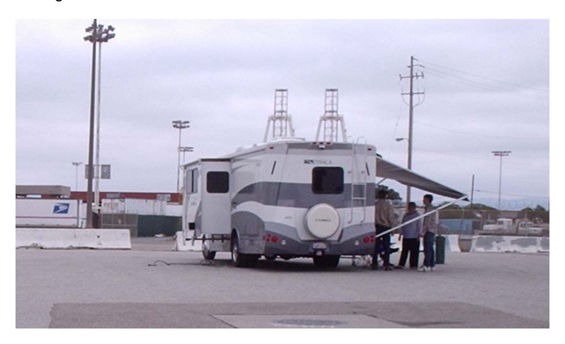
A family setting up camp on the Postal Service leased lot, potentially to take advantage of adjacent parklands along San Francisco Bay. August 7, 2007.

Our discussions with Postal Service employees and managers also identified concerns about unauthorized use of Postal Service property, with transient or homeless people sleeping in the parking lot, seeking protection from the elements inside the open trailers, and using Postal Service pallets, mailbags, hampers, or other equipment to improve their encampments. In addition, on August 7, 2007, we observed what appeared to be a family setting up their camper on the unsecured lot. Postal Service employees expressed concern that if someone were injured on or by Postal Service property there could be legal action and unrecoverable financial loss.