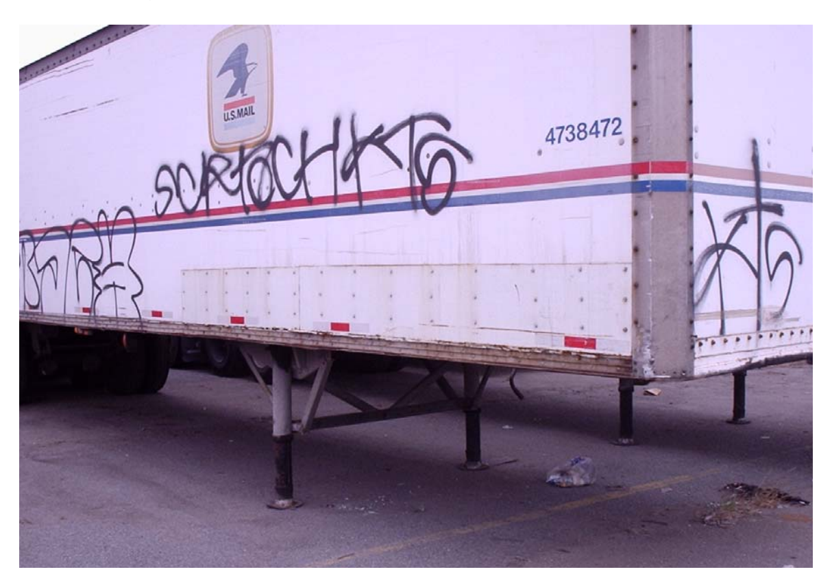
A Postal Service owned trailer, covered with graffiti, on the San Francisco P&DC's unsecured storage lot August 7, 2007.

unsecured lot to observe conditions; and on October 17, 2007, we conducted additional observations. As a result of our follow-up observations, we noted that P&DC officials had removed MTE, locked open trailers, and reduced the number of trailers stored on the lot. However, other security concerns continued to exist. For example, we noted both Postal Service owned trailers and National Trailer Lease equipment had been vandalized with graffiti, and we noted evidence that transient or homeless people were