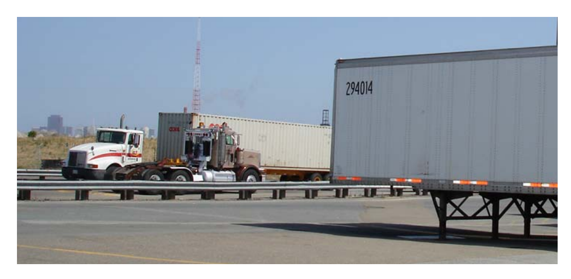
A non-Postal Service tractor-trailer and tractor without a trailer passing through the unsecured lot on May 17, 2007.

Our January 9, 2008, inspection of the parking lot identified an area open to high-traffic industrial activity along the waterfront, including an active maritime operation, a waste recycling facility, and an electric power plant. The area is also open to public parklands along San Francisco Bay and has free access from San Francisco city streets and