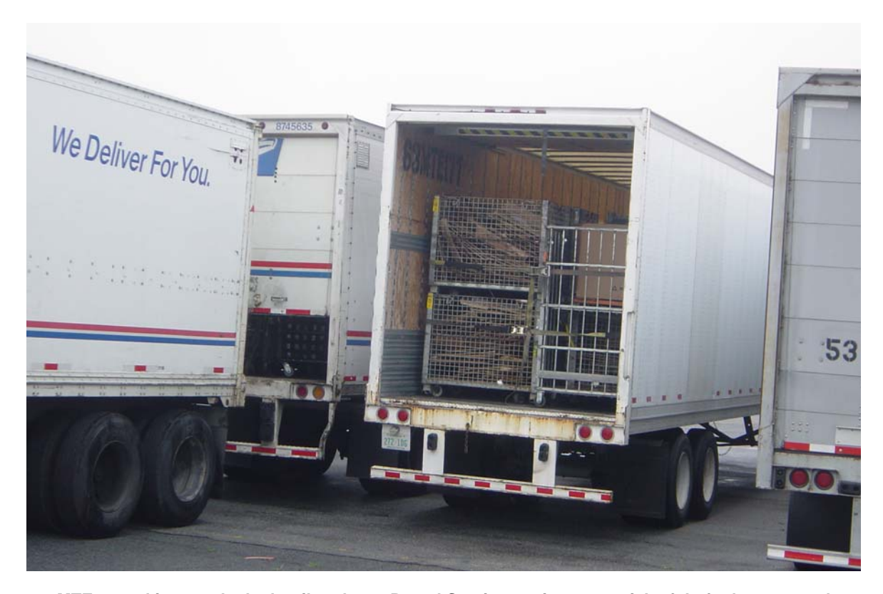
MTE stored in an unlocked trailer places Postal Service equipment at risk of theft, damage, and unauthorized use because it provides material for transient people to improve their encampments. Photograph taken at the unsecured lot on January 9, 2008.

On January 16, 2008, we advised the Vice President, Pacific Area Operations, of our observations and explained we would follow up with a written audit report. The Vice President explained he would take immediate action to address the problem by contacting appropriate officials.