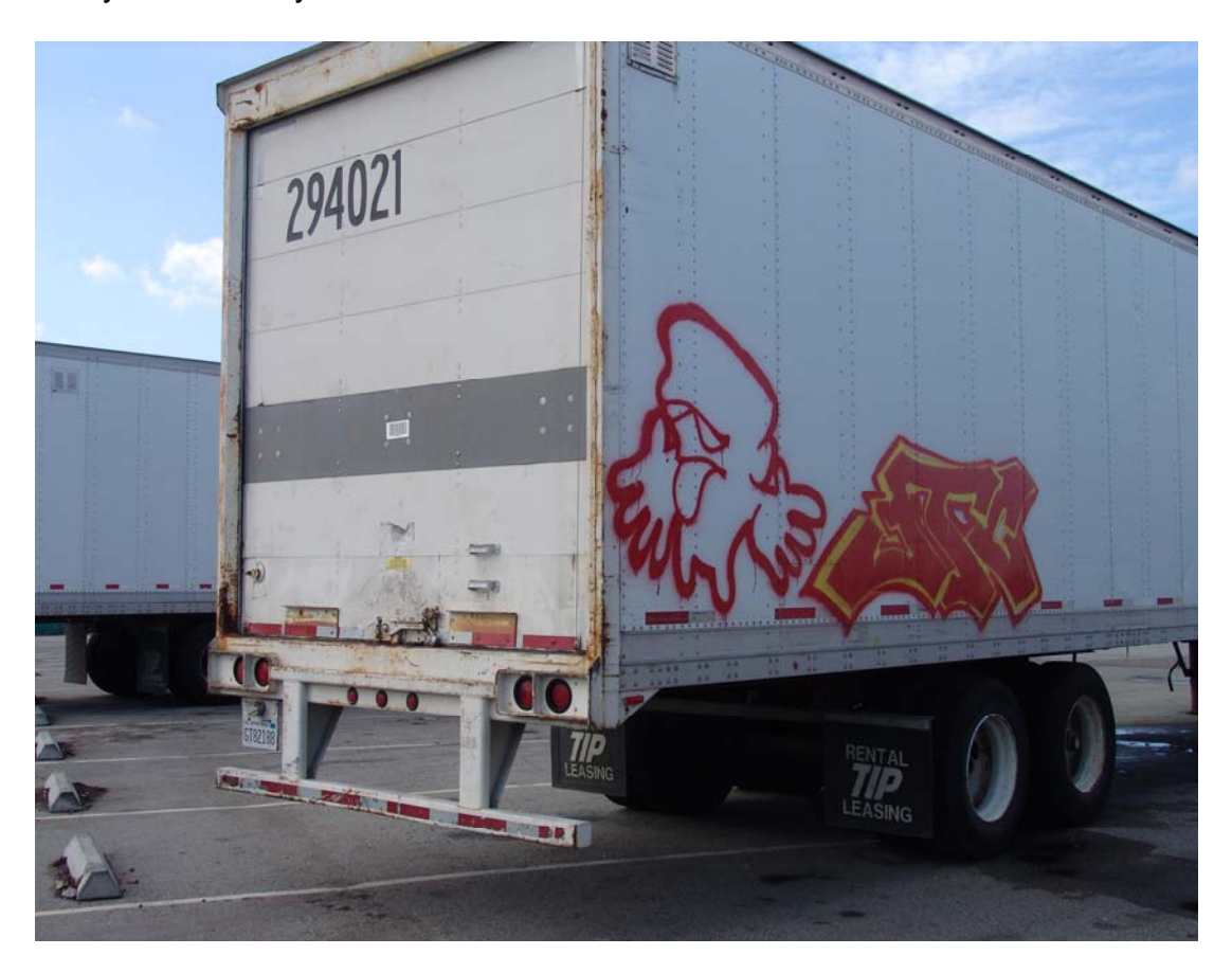
Vandals defaced this leased TIP trailer with graffiti. The Postal Service will incur unanticipated costs to repair the trailer before it can be returned to the leasing contractor. Photograph taken at the unsecured lot October 17, 2007.

During our work, we interviewed Postal Service officials from the Pacific Area, the San Francisco District, the San Francisco P&DC, and the Postal Inspection Service. We interviewed P&DC managers, supervisors, and employees. We observed and photographed conditions at the unsecured lot, inspected trailers, and examined the lease between the Postal Service and the San Francisco Port Commission. We examined relevant Postal Service policies and procedures, including the Postal Operations Manual , dated July 2002, with revisions through April 2007; the Postal Service fleet management policy, dated March 1991; and a Memorandum of Policy from the Postal Service Senior Vice President, Operations, dated October 1, 2001. We also relied on our past vehicle fleet management work, particularly that work associated with fleet safety and security.