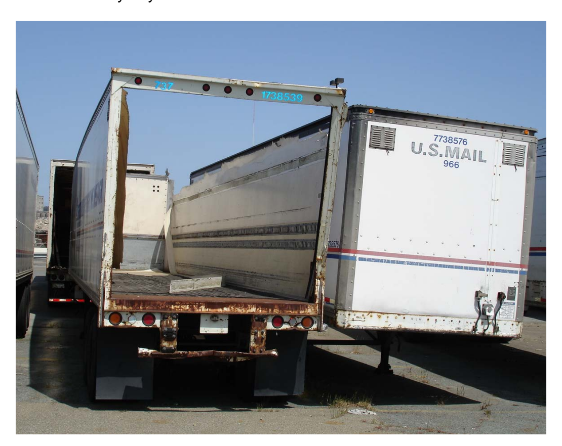
A severely damaged Postal Service owned trailer, stored at the unsecured lot on May 17, 2007.

On June 7, 2007, we filed a "Security Deficiency Referral" with the U.S. Postal Inspection Service, San Francisco Division, and followed up with San Francisco P&DC officials. On June 18, 2007, we notified Postal Service Pacific Area officials and on June 20, 2007, we notified Postal Service San Francisco District officials. We recommended that officials correct the unsecured conditions, return unneeded trailers to the leasing contractor, and repair or dispose of damaged Postal Service owned trailers. San Francisco P&DC officials said they would consider installing a perimeter fence, consider other permanent security solutions, lock all trailers, and inventory trailers parked at the lot every day.