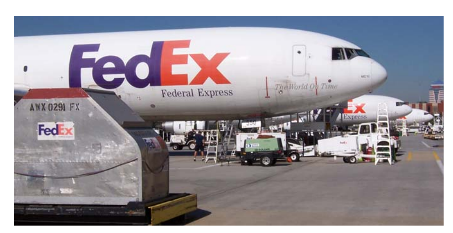
<u>FedEx</u> – On August 2, 2006, the Postal Service announced that it had truncated its original 2001 FedEx contract and

The Postal Service currently uses terminal handling services (THS) contractors to load mail into FedEx air containers.