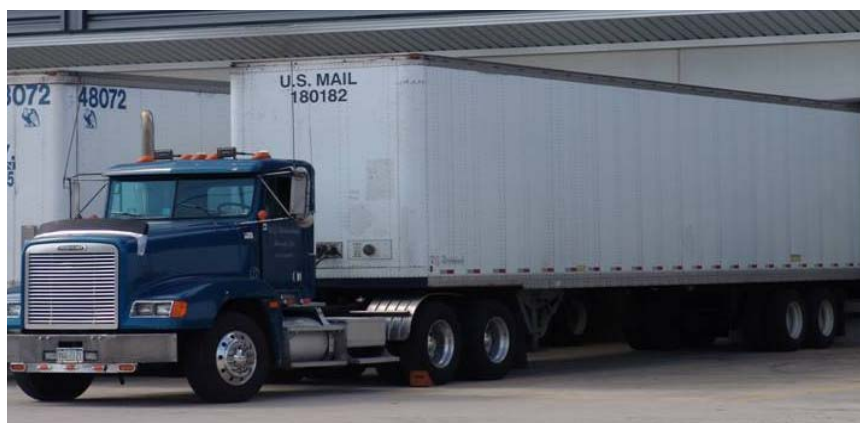
Philadelphia P&DC, September 20, 2006.

The Postal Service transportation network is dynamic and requirements constantly change. As we discussed in the objectives, scope, and methodology section of our report Postal Service data has certain limitations. Accordingly, throughout our audit we coordinated extensively with plant and area transportation officials and proposed service reductions to them. The officials then reviewed each proposal in conjunction with their own assessment of