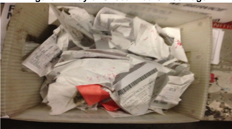
Figure 1. Tray of Unscanned CN-35 Tags