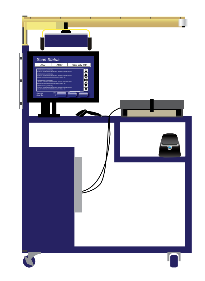
Figure 1: PASS Unit