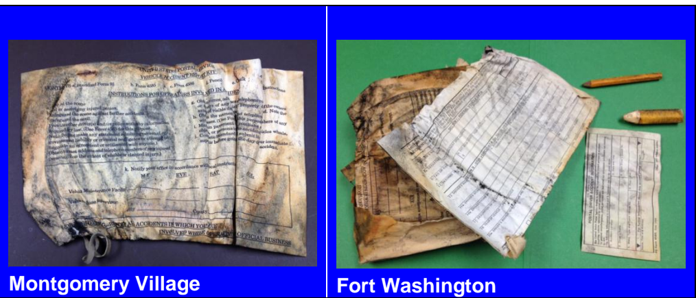
Table 2: Unusable Accident Reporting Kits

Columbia Heights Station revealed that management did not allow them time to perform vehicle inspections. Carriers at the Fort Washington Post Office stated that they recently started performing inspections again. In addition, at 18<sup>11</sup> of the 23 locations we visited, we could not locate accident reporting kits<sup>12</sup> in Postal Service vehicles or they were unusable. See Table 2 for examples of unusable kits.