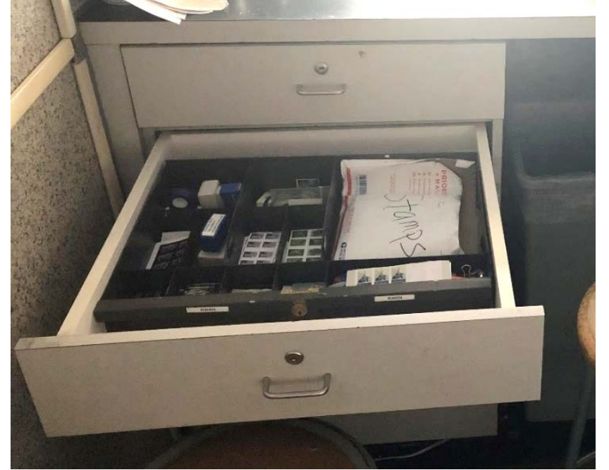
Figure 2. Unsecured Drawer Containing Stamp Stock