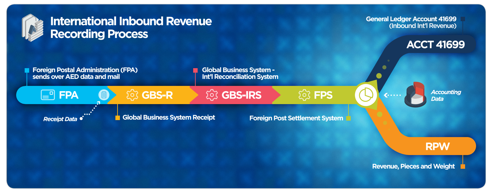
Chart 1. Global Business System to Revenue Pieces and Weight Data Flow