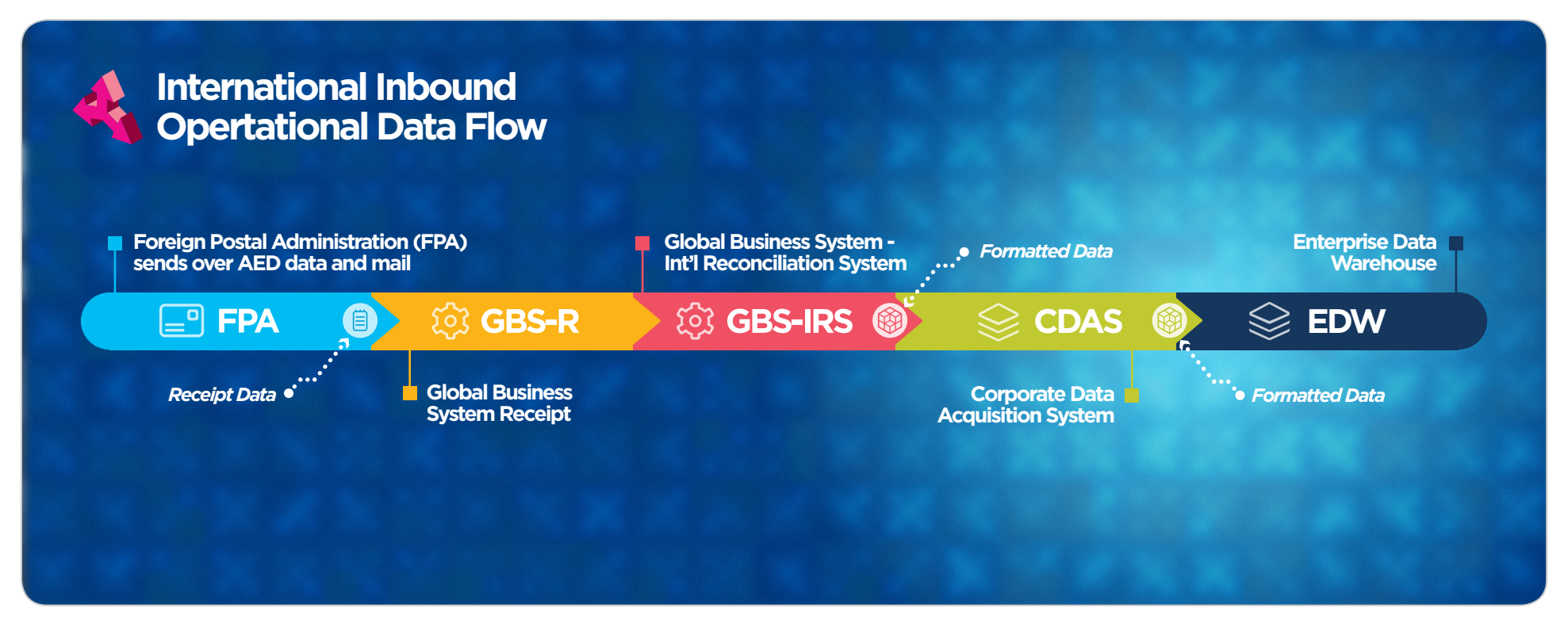
Chart 2. Global Business System to Enterprise Data Warehouse Data Flow