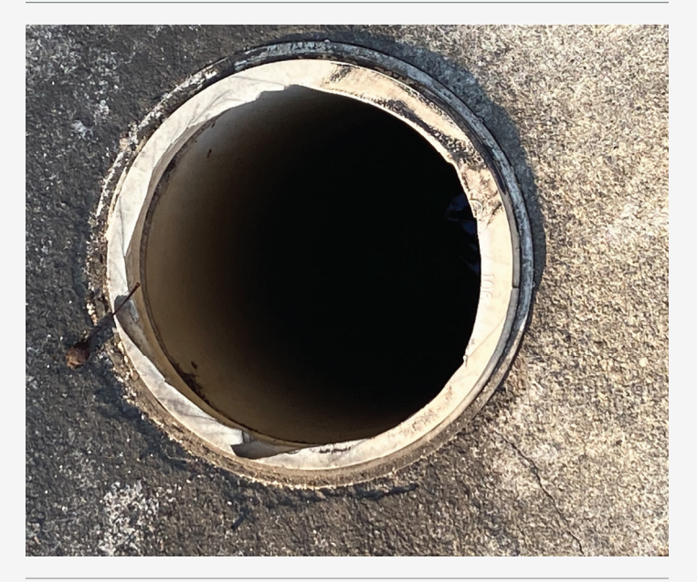
Figure 2. Uncovered Drainage Hole in Postal Vehicle Lot