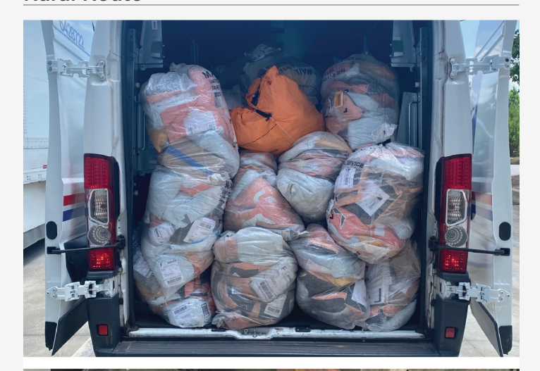
Figure 1. Example of Parcel Volume for One Rural Route

In addition, we noted that most of the packages with "Delivered" scans at the unit from May to July 2022 were destined for one business address. However, the carrier that delivered to this route did not always use a firm sheet. Due to the high volume of parcels for the route (see Figure 1), management provided additional assistance (custodial team) to make extra deliveries. These individuals scanned packages as "Delivered" while at the unit.