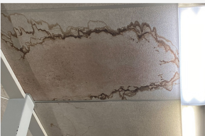
Figure 4. Examples of Stained Ceiling Tiles