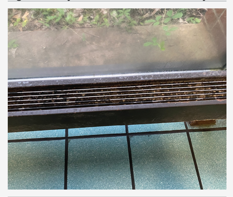
Figure 6. Dirty Heat Vent in Customer Lobby