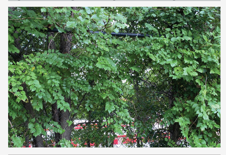
Figure 3. Overgrown Vegetation Along Fence