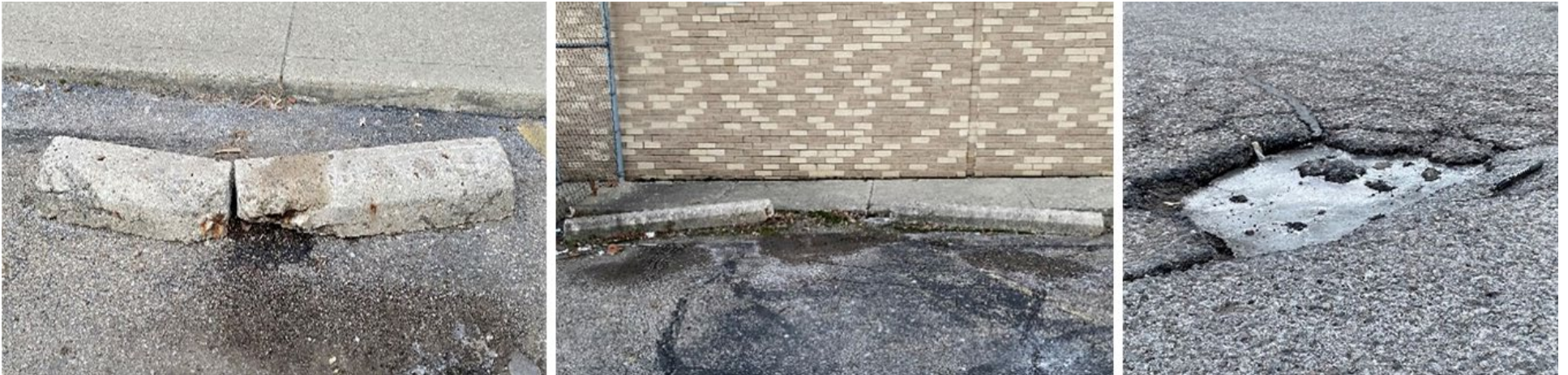
Figure 4. Customer Parking Lot Issues