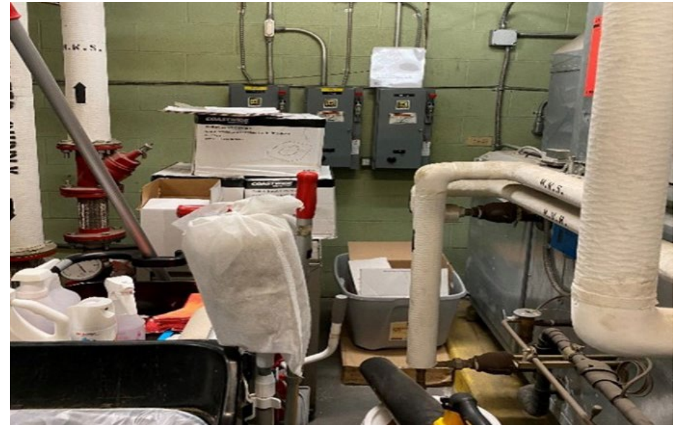
Figure 2. Blocked Electrical Panels