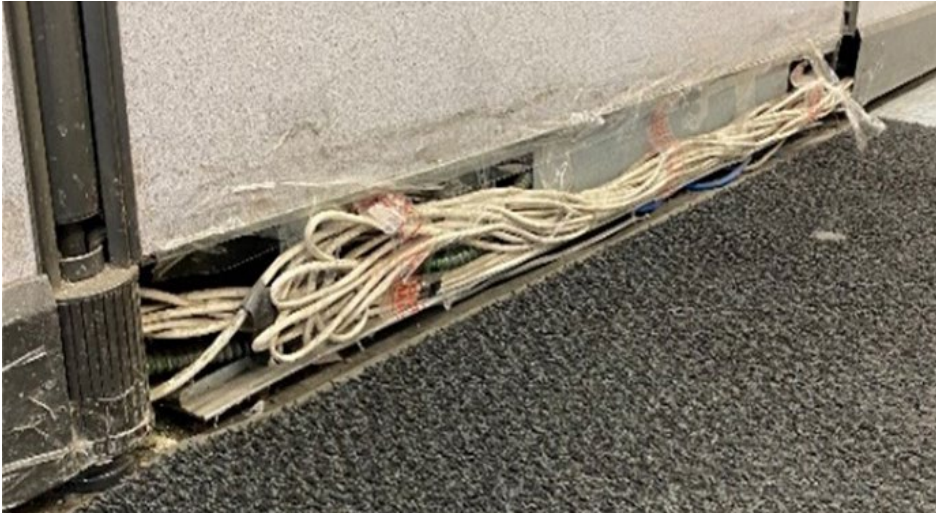
Figure 3. Exposed Wiring