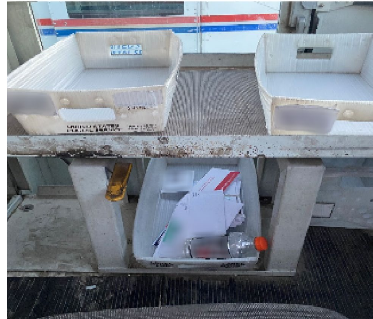
Figure 1. Delayed Mail Found in Unlocked Vehicle