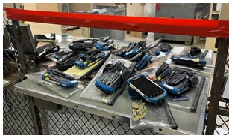
Figure 3. Accountable Items Left at Unmanned Registry Cage