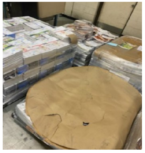
Figure 2. Delayed Flats and First-Class Letters