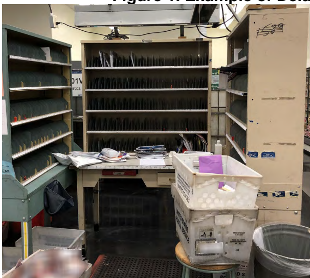
Figure 1. Example of Delayed Mail in one Carrier Case