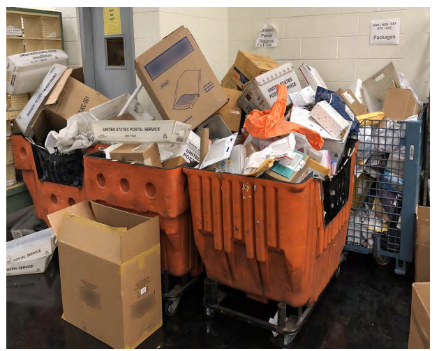
Figure 3. Delayed Mail Found in the Return to Sender and Postage Due Areas