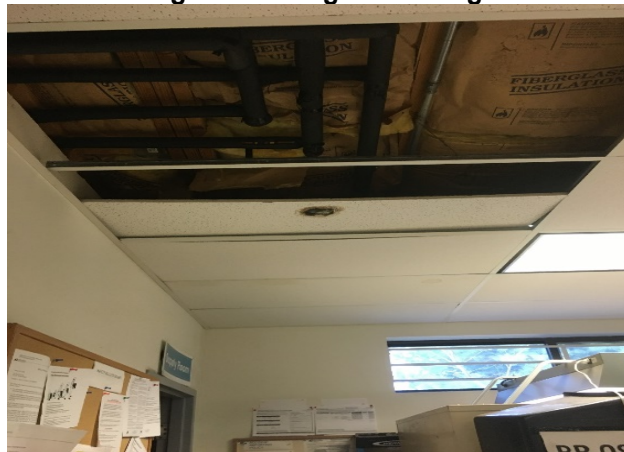
Figure 6. Evidence of Potential Mold; Missing and Misaligned Ceiling Tiles