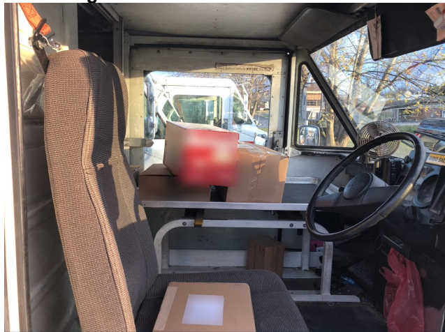
Figure 9. Unlocked Trucks with Mail