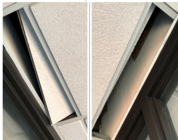
Figure 2. Misaligned and Missing Ceiling Tiles In Lobby Entrance