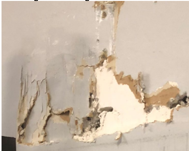
Figure 3. Damaged Wall in Breakroom