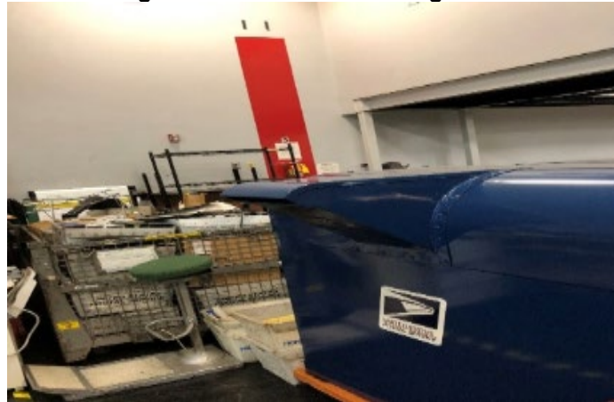
Figure 7. Blocked Fire Extinguisher