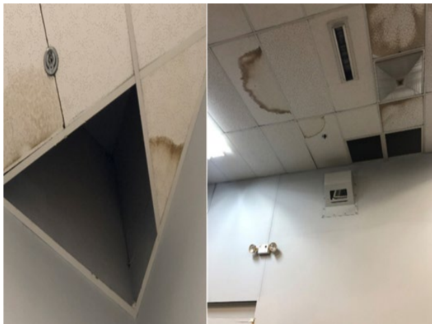
Figure 1. Missing and Stained Ceiling Tiles in Workroom Area