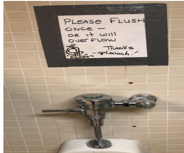
Figure 4. Semi-Operable Urinal in Men's Restroom