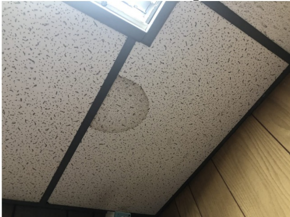
Figure 5. Stained Ceiling Tiles in Lobby