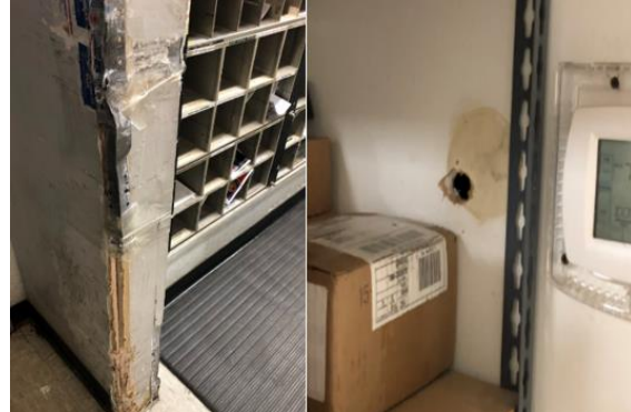
Figure 8. Damaged Walls