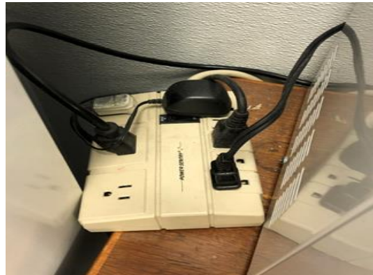
Figure 12. Appliances Improperly Connected