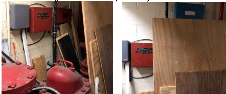
Figure 13. Blocked Sprinkler System Panel