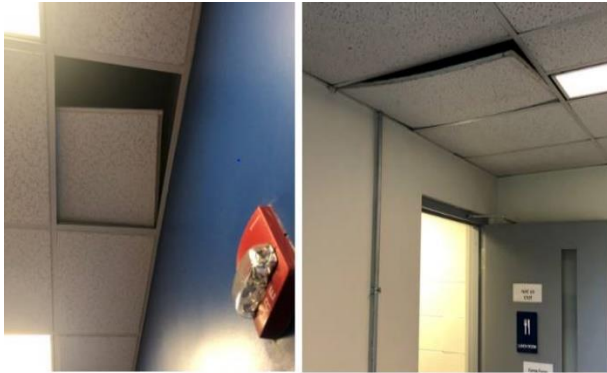
Figure 5. Misaligned and Bulging Ceiling Tiles