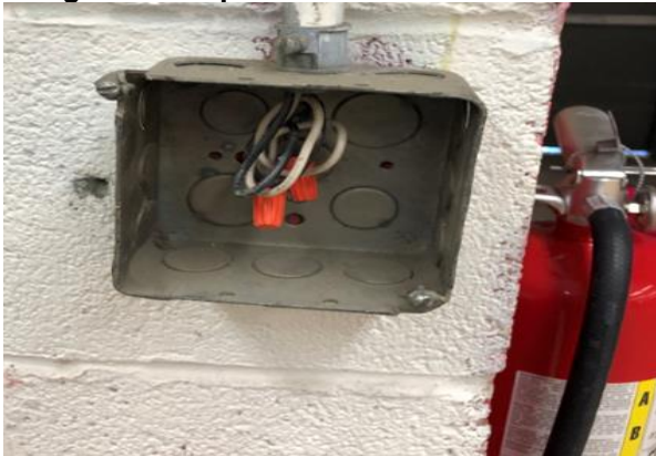
Figure 14. Exposed Electrical Outlet Panel