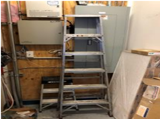
Figure 11. Blocked Electrical Panel and Unsecured Ladder