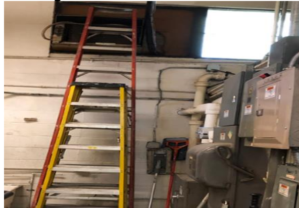
Figure 15. Blocked Electrical Panel