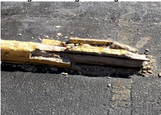
Figure 9. Damaged Parking Block