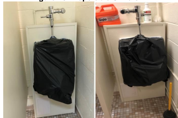
Figure 10. Inoperable Urinals