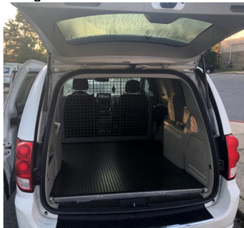
Figure 17. Unlocked Carrier Truck