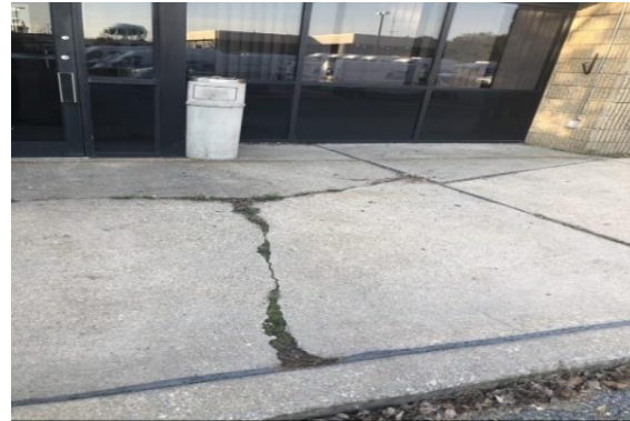
Figure 6. Cracked Sidewalk