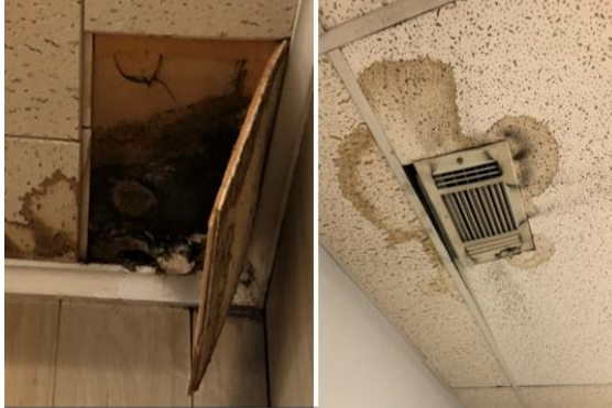
Figure 7. Damaged and Stained Ceiling Tiles