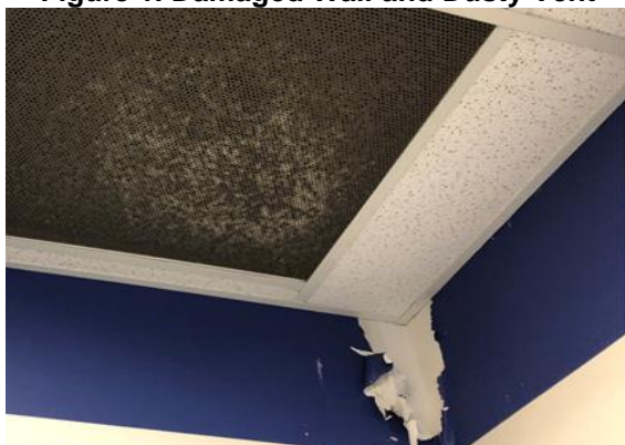
Figure 1. Damaged Wall and Dusty Vent