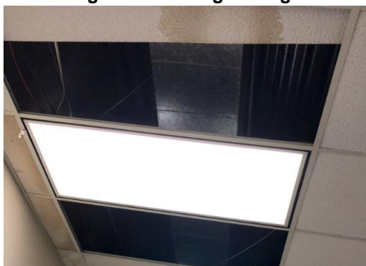
Figure 3. Missing Ceiling Tile

Source: (OIG) photograph taken October 7, 2020.