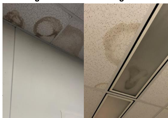
Figure 4. Stained Ceiling Tiles