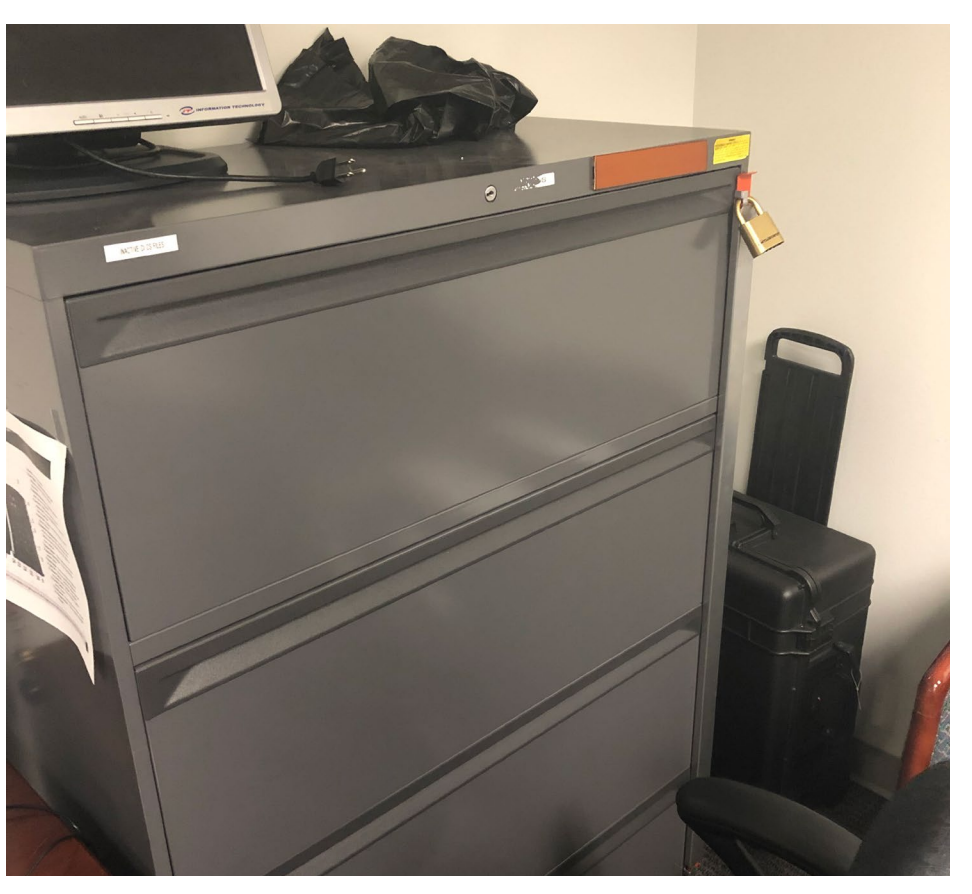
Figure 3. Category I Secured File Cabinet Containing CFP Files