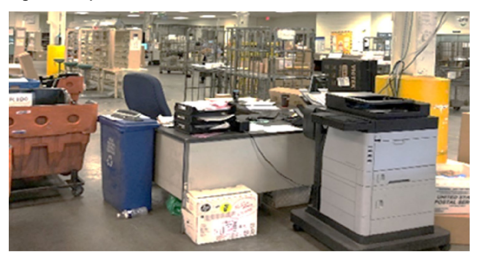
Figure 2. Supervisor's Desk on a Workroom Floor

Source: OIG photograph taken during tour at a post office in VA showing a designated area used to store suspected mail. No suspected mail is shown in this photo.