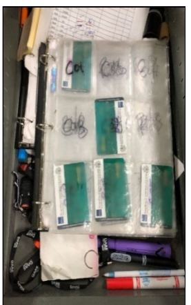
Figures 3, 4, 5, and 6. Examples of Voyager Cards Binder

Employees did not properly secure assets at the Allen Post Office. Specifically, during our visit on November 21, 2019 we were able to locate only 11 of 52 Voyager Fleet cards (see Figures 3 through 6). Carriers stated they stored their Voyager cards in various places including their mailbags and wallets. Management stated that carriers failed to turn in the Voyager cards, broke or lost them, and failed to report it. Postal Service policy states that Voyager Fleet cards are accountable items and should be treated as such; they should never be carried by off-duty personnel or left in unattended vehicles or in other locations with unrestricted access.<sup>17</sup>