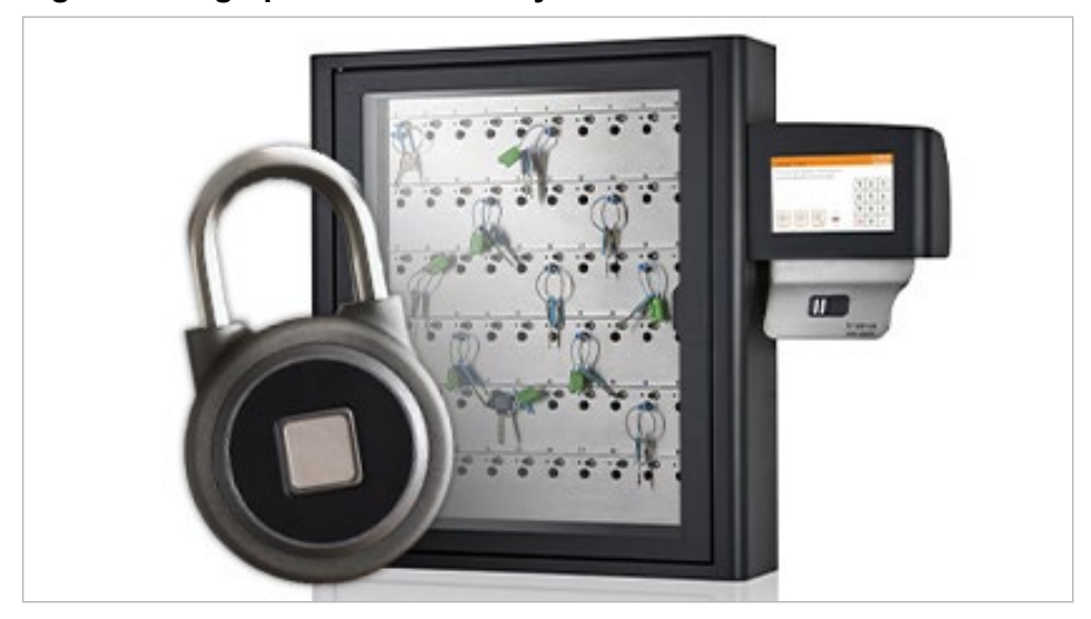
Figure 1: Fingerprint Lock and Key Cabinet

Keyless lock options eliminate the need for keys and include electronic keypads, fingerprints, and other mechanisms to gain access. Key tracking options, which could significantly reduce the amount of manual daily tracking, include Radio Frequency Identification and barcodes with built-in tracking intelligence. Keyless lock options and key tracking can operate as standalone solutions that do not require broadband capability, which may not always be available in certain areas (see Figure 1).