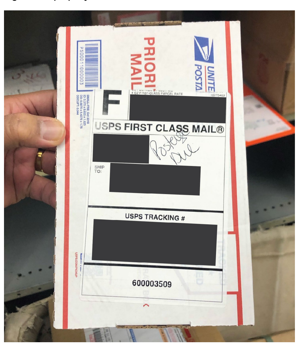
Source: U.S. Postal Service Office of the Inspector General (OIG) photo taken during a site visit to the downtown Charlotte Post Office on December 11, 2019.