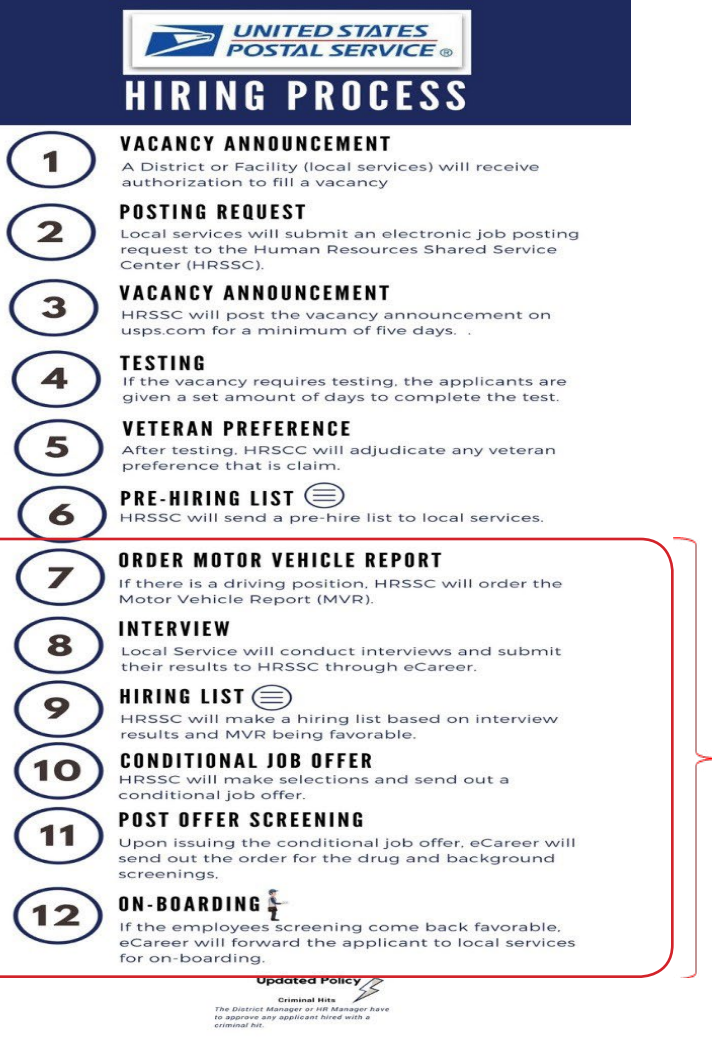
Figure 2: Postal Service Hiring Process