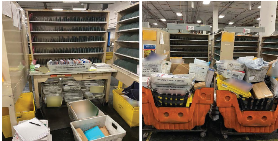
Figure 1. Examples of Delayed Mail